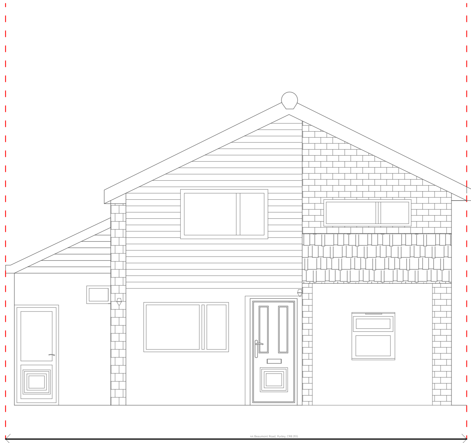
1 Existing Elevation - South East (Front) View