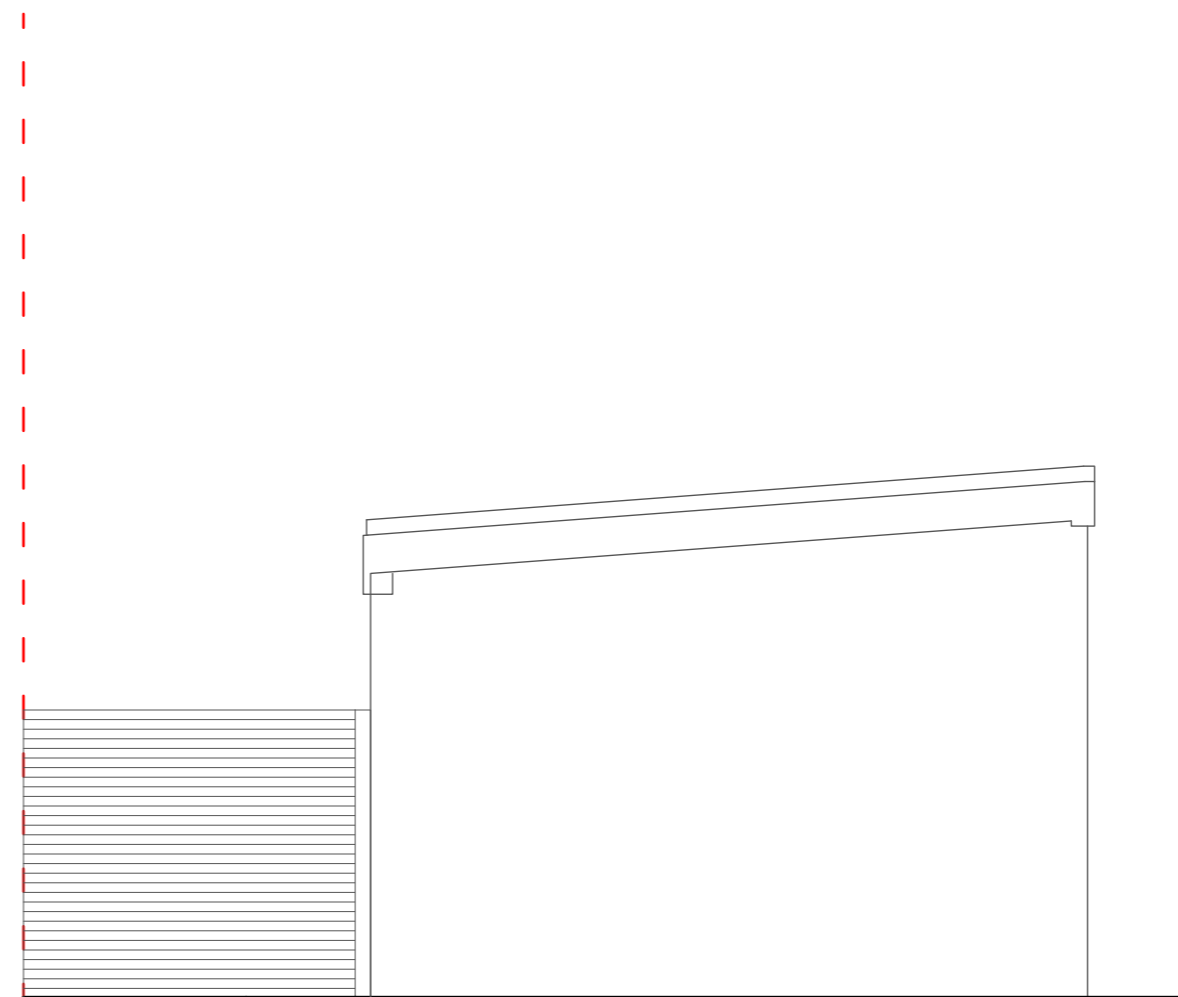
1 Existing Elevation - East View (Outbuilding)