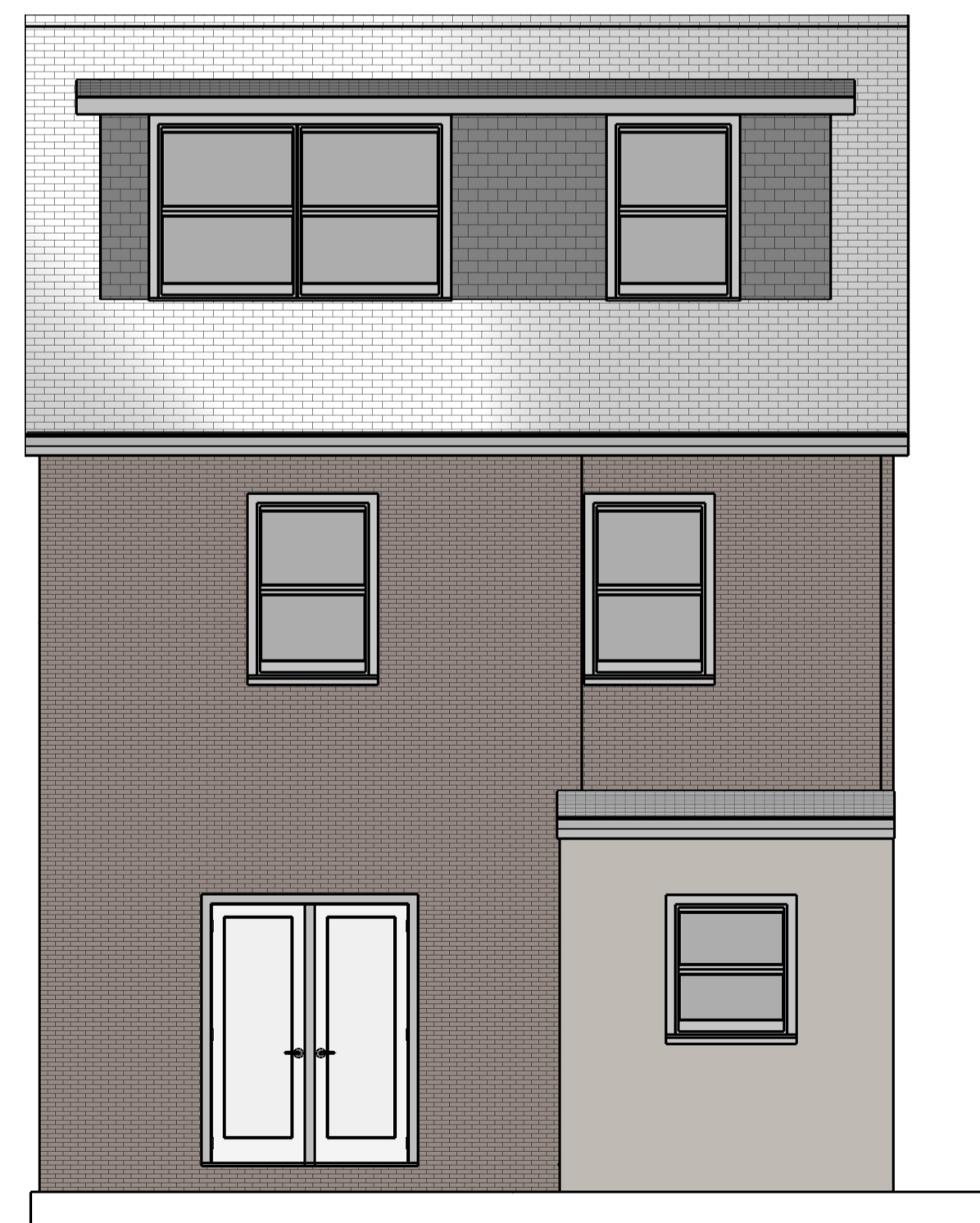
Existing elevation rear