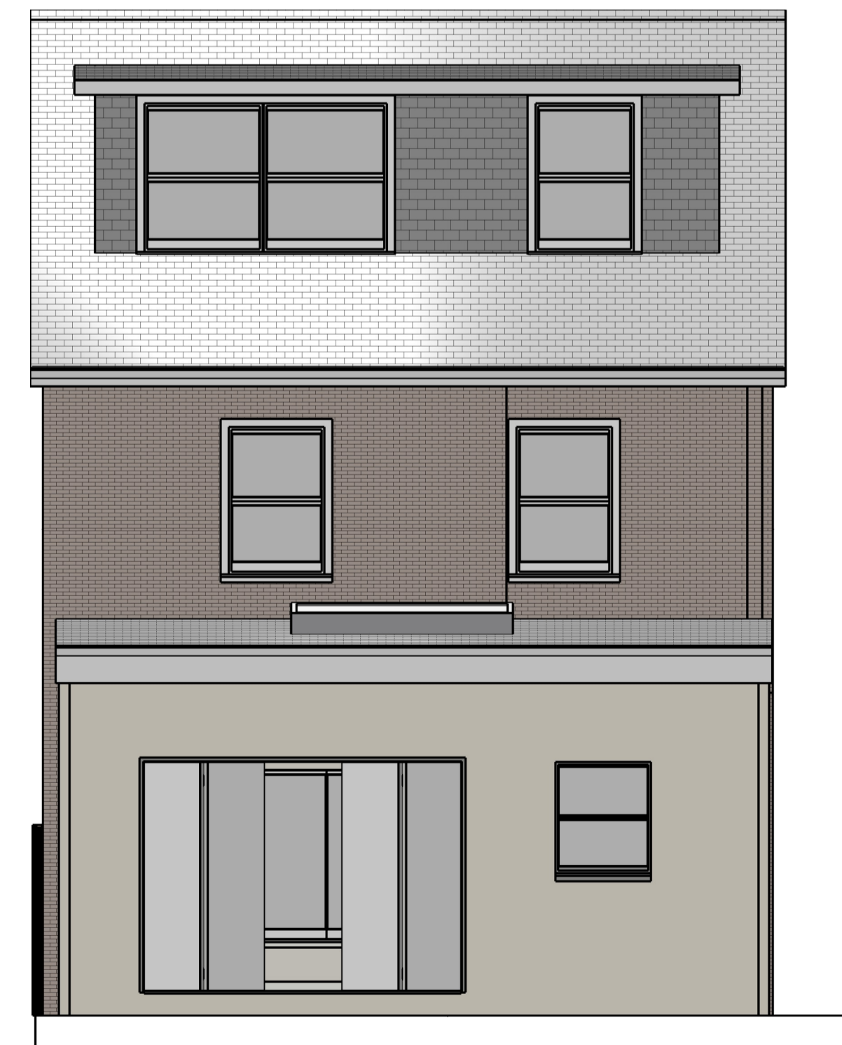
Proposed elevation rear