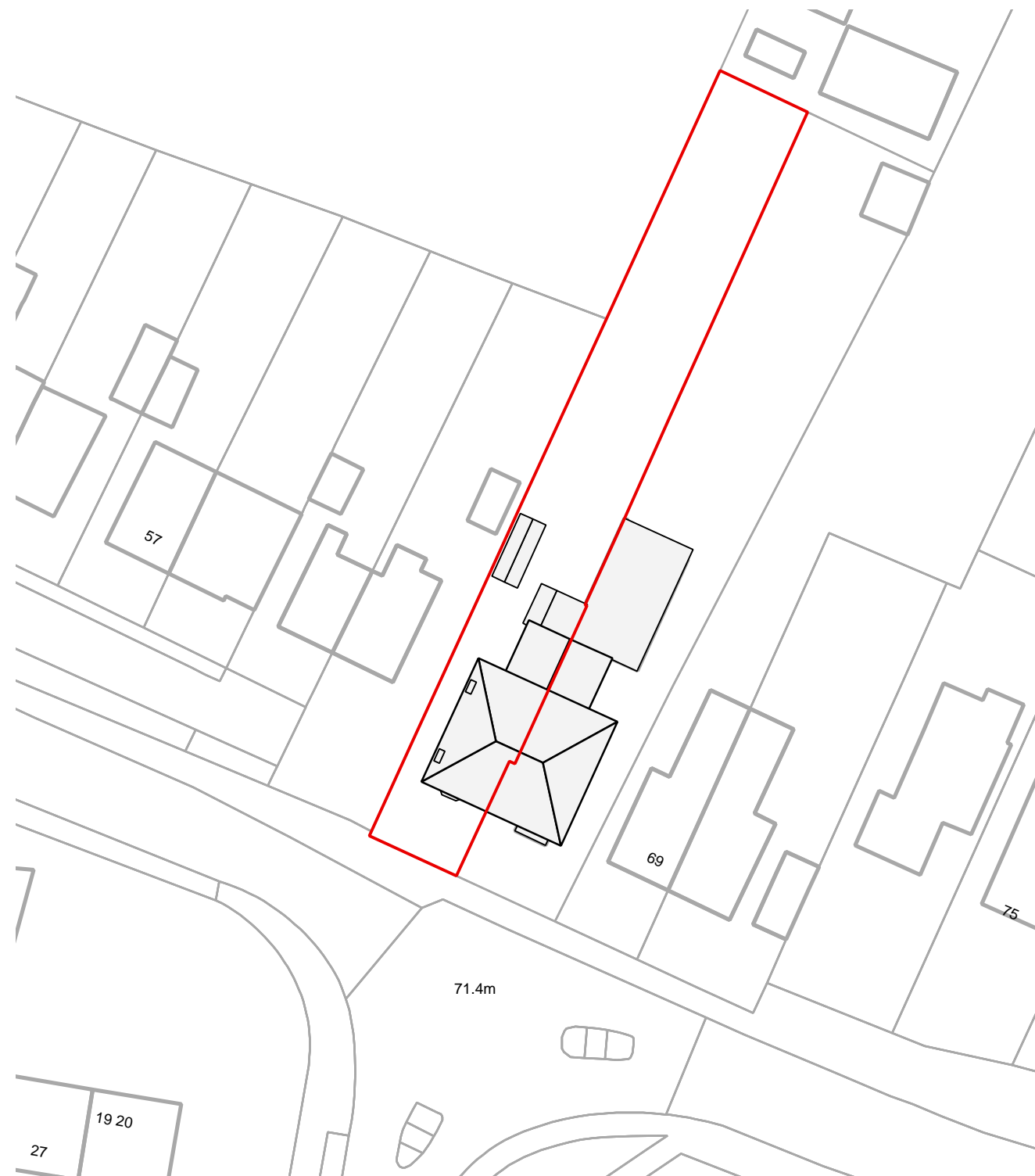
Site Plan Scale: 1:500

General Notes : Do not scale off drawings. These drawings are concept only and are not for construction. all financial, structural and building control items are to be considered by additional specific professional advice