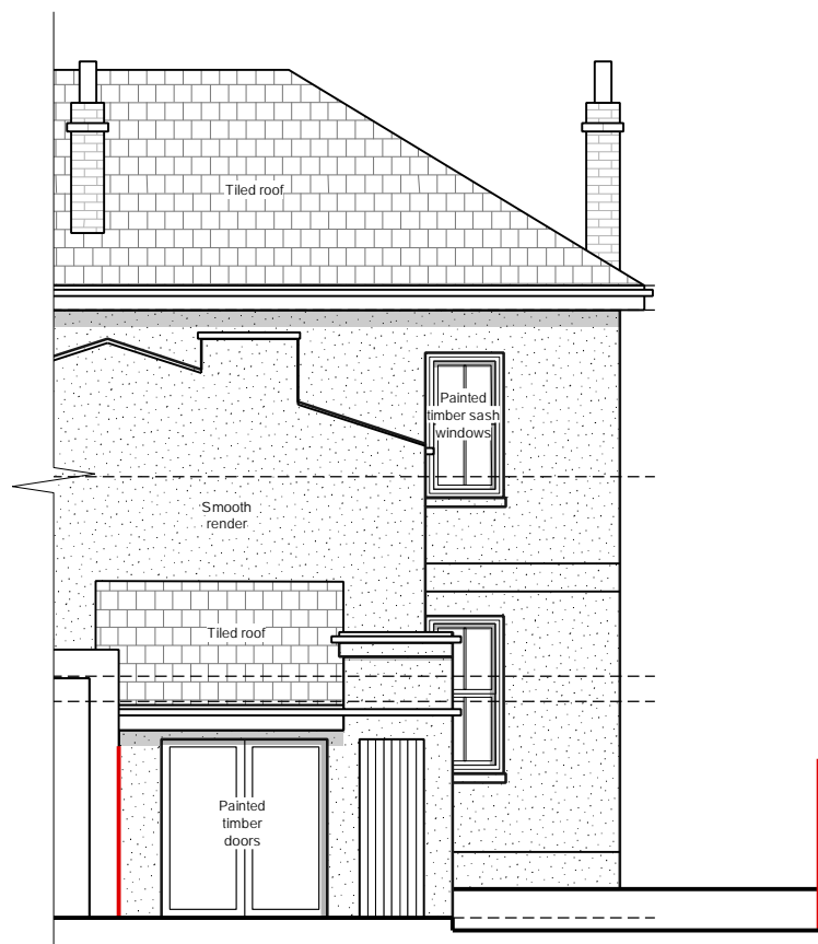
Existing North Elevation Scale: 1:100