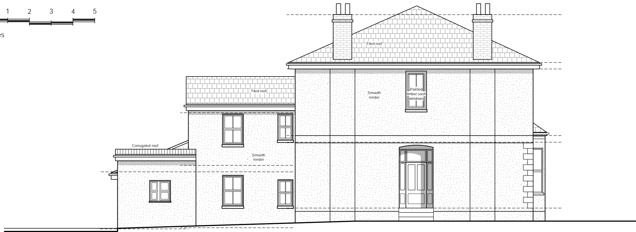
Existing West Elevation Scale: 1:100

General Notes : Do not scale off drawings. These drawings are concept only and are not for construction. all financial, structural and building control items are to be considered by additional specific professional advice