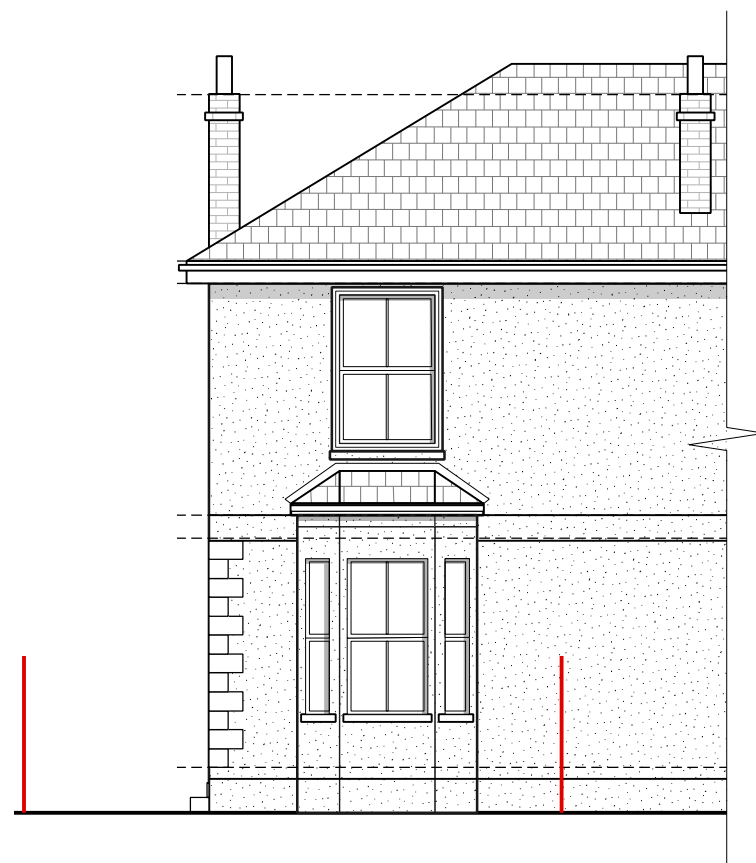
Existing South Elevation Scale: 1:100