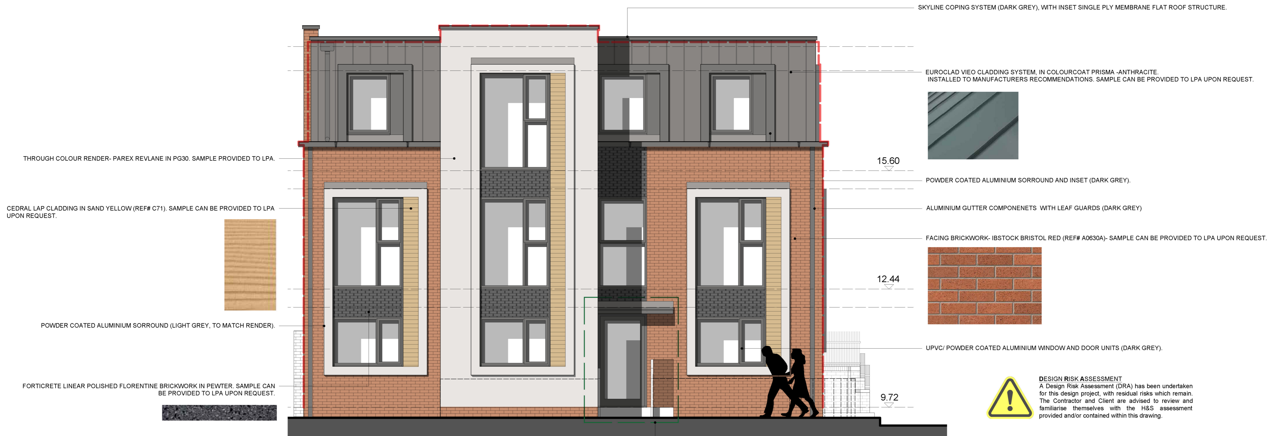
PROPOSED FRONT ELEVATION WITH MATERIAL SPECIFICATION 1:50 @ A2

Please see details for main entrance adjacent.