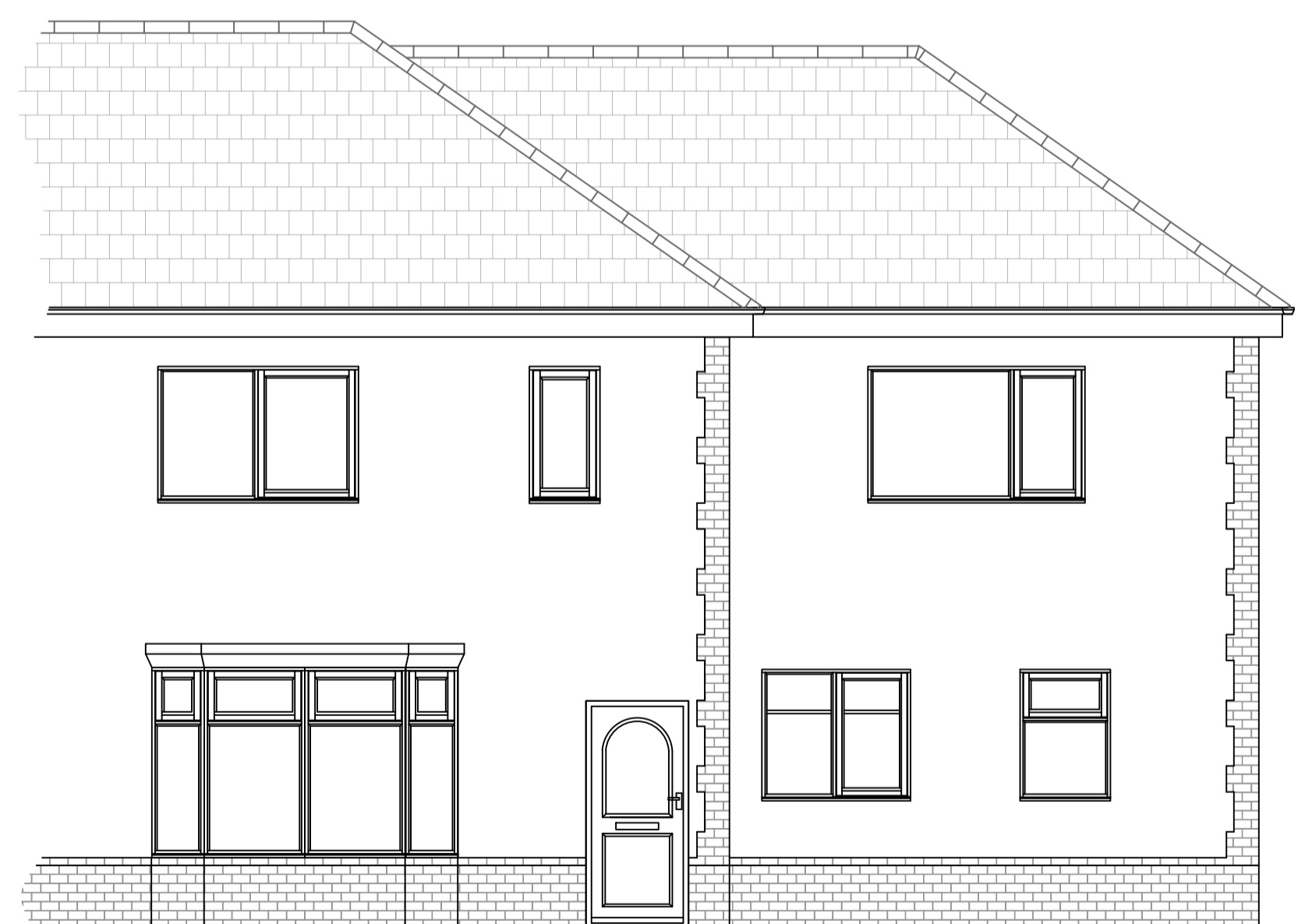
Existing front elevation Scale 1:50