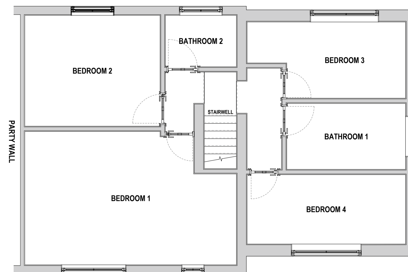
Existing First Floor Plan Scale 1:50