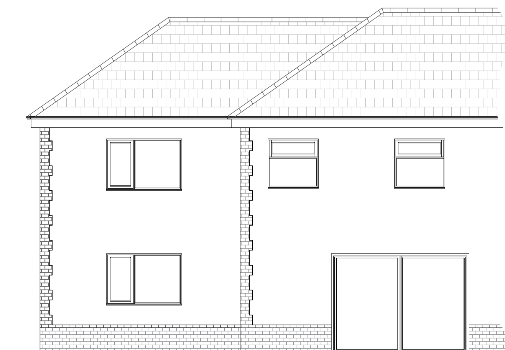
Existing rear elevation Scale 1:50