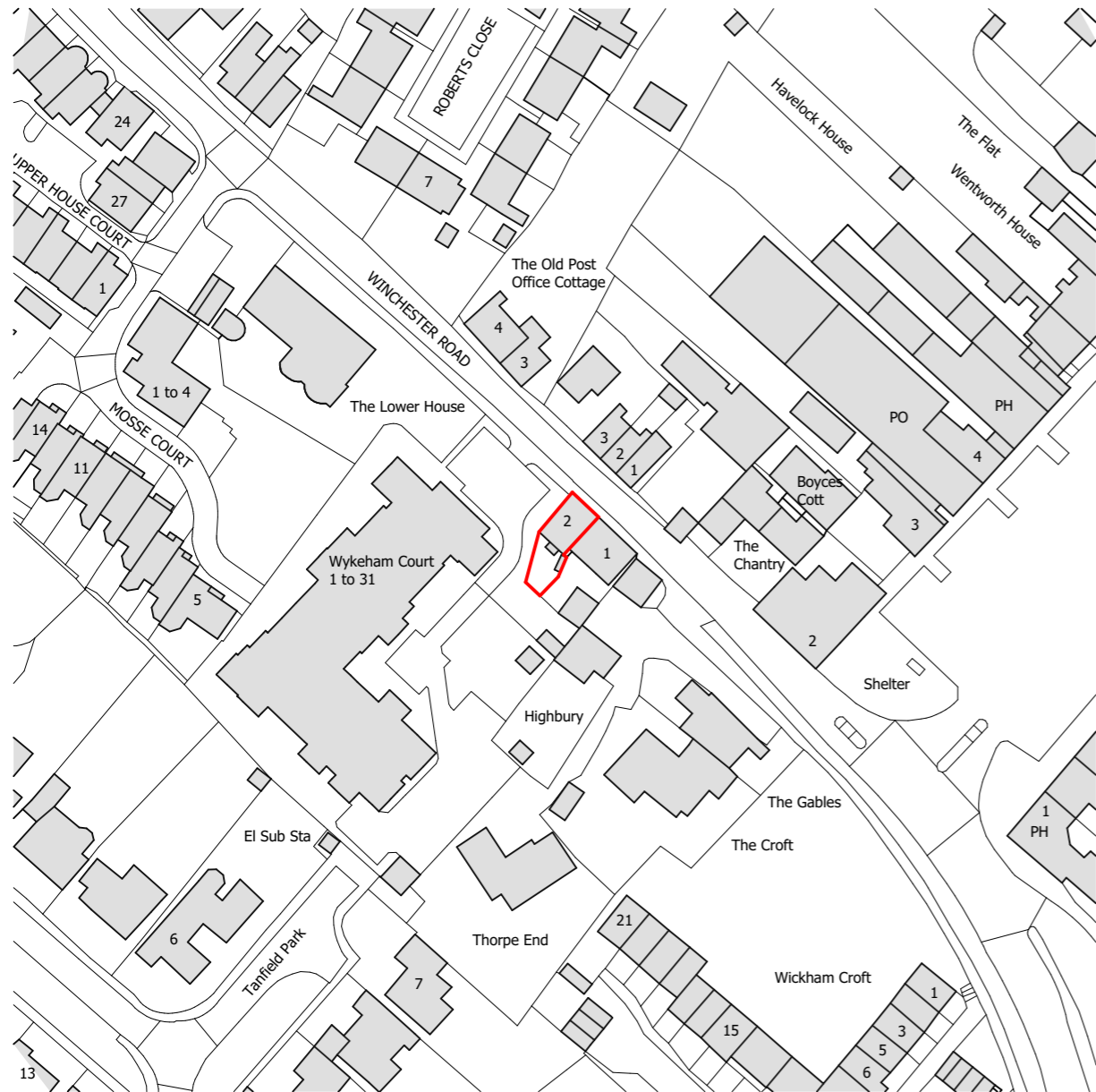
LOCATION PLAN 1:1250 [OS Map Licence No. 100031961/312367]