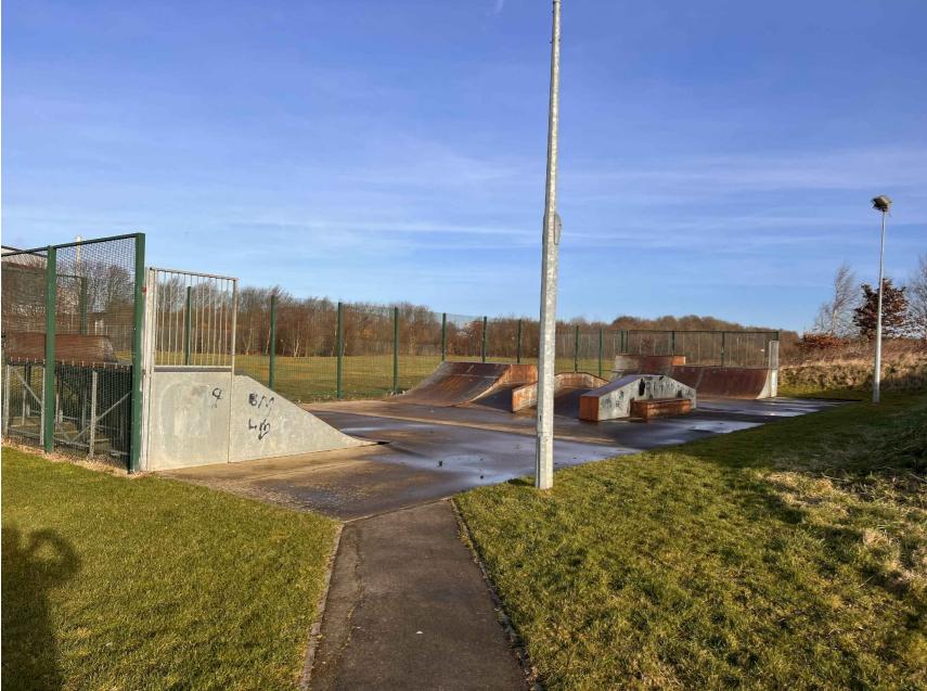
Photo of existing Skate Park on Charlie Wayman Site - to be relocated in same format to Miners Welfare Site

PROPOSED MINERS WELFARE SITE scale: 1:1250 @ A1 date: 09.08.23 drawn by: LC drg: 1329.04D checked by: xx