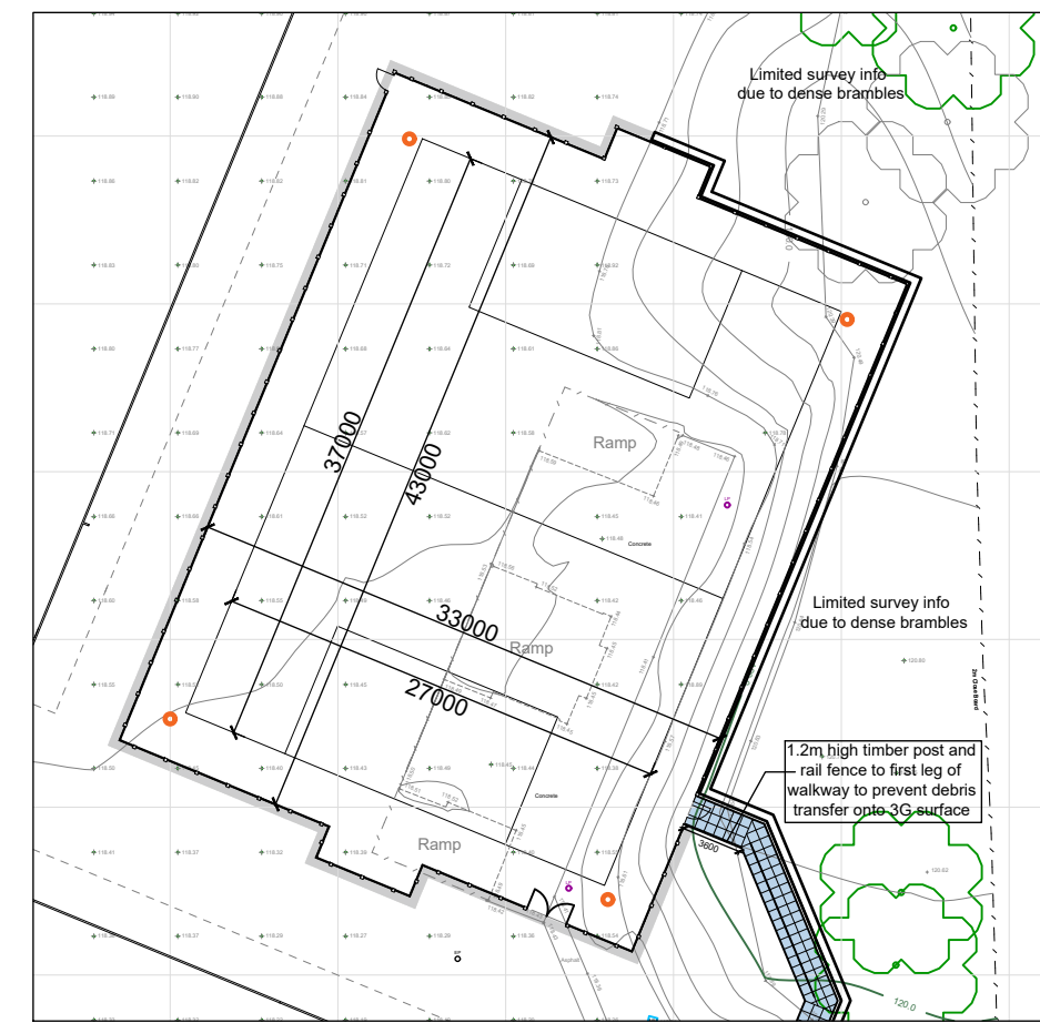
SCALE BAR 1:200 0m 5m 10m