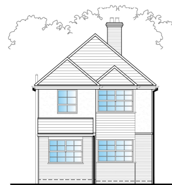
Existing Front Elevation (1:100)