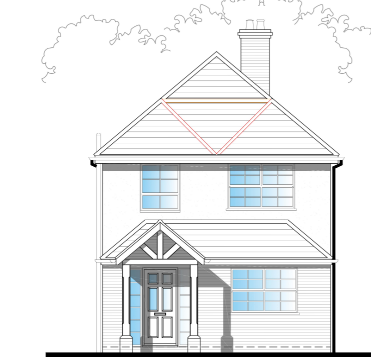
Proposed Front Elevation (1:100)