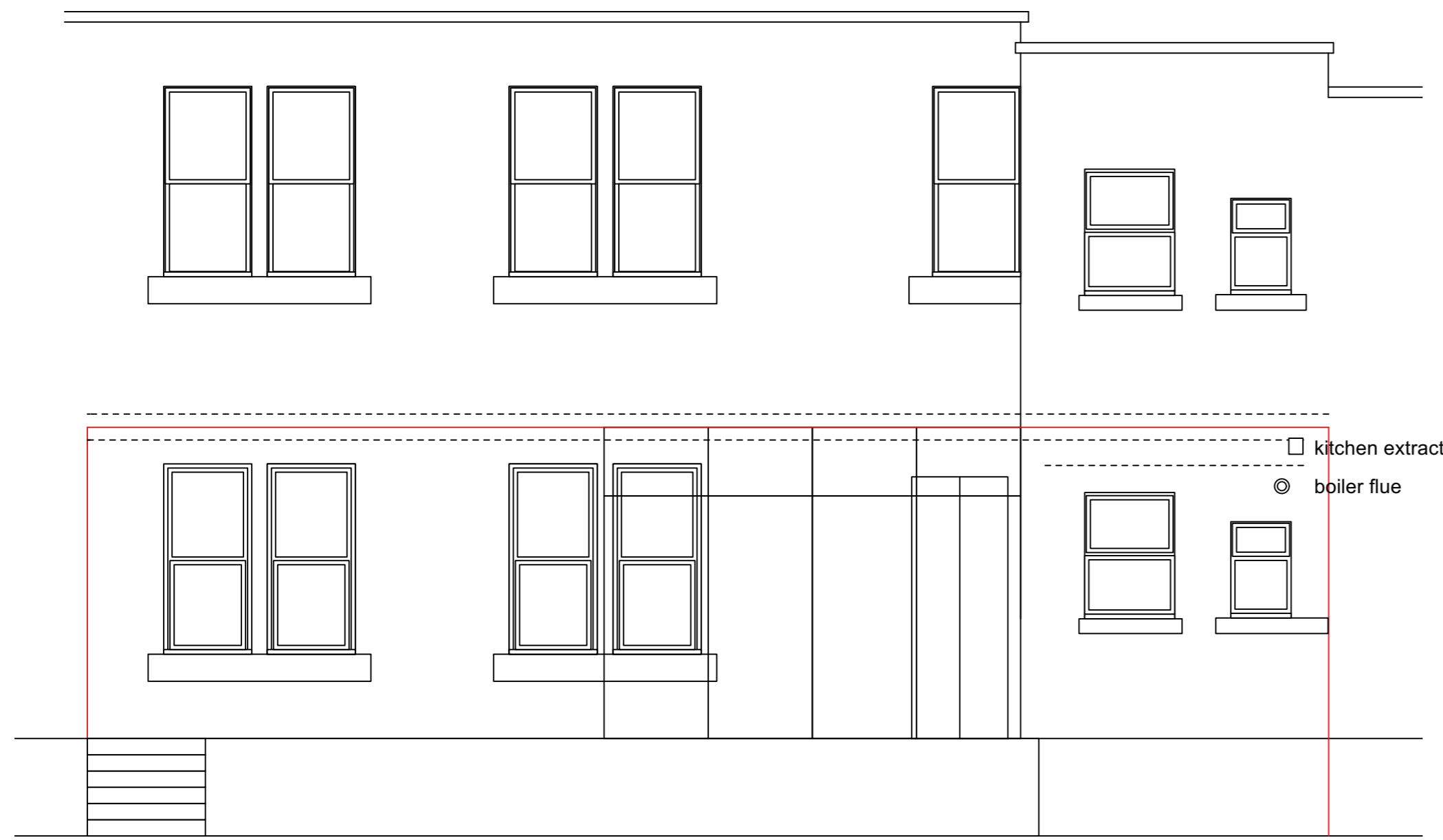
1 Existing Rear Elevation Scale: 1:50