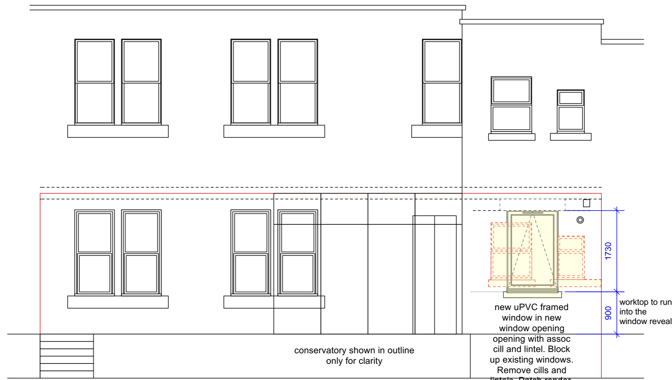
3 Proposed Rear Elevation Scale: 1:50