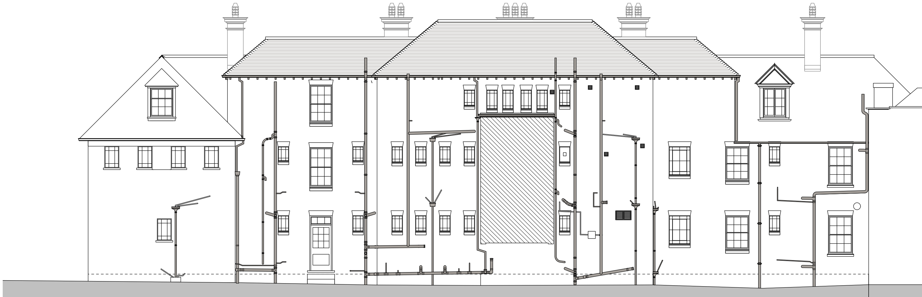
NORTH ELEVATION B FROM INSIDE BOUNDARY WALL