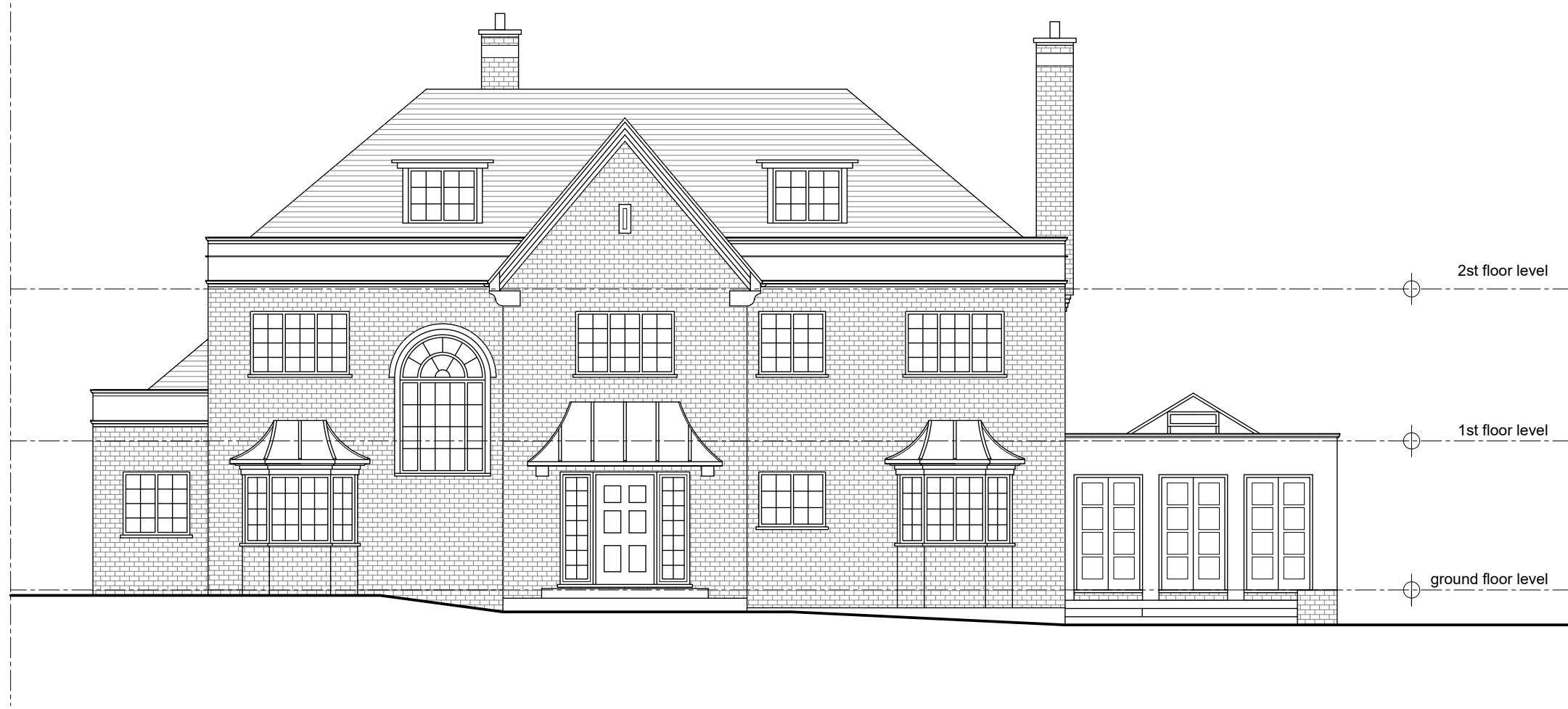
North (Front) Elevation