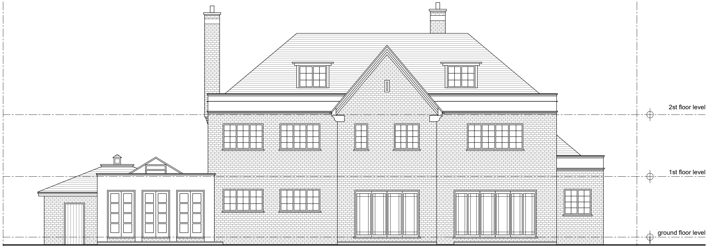
South (Rear) Elevation