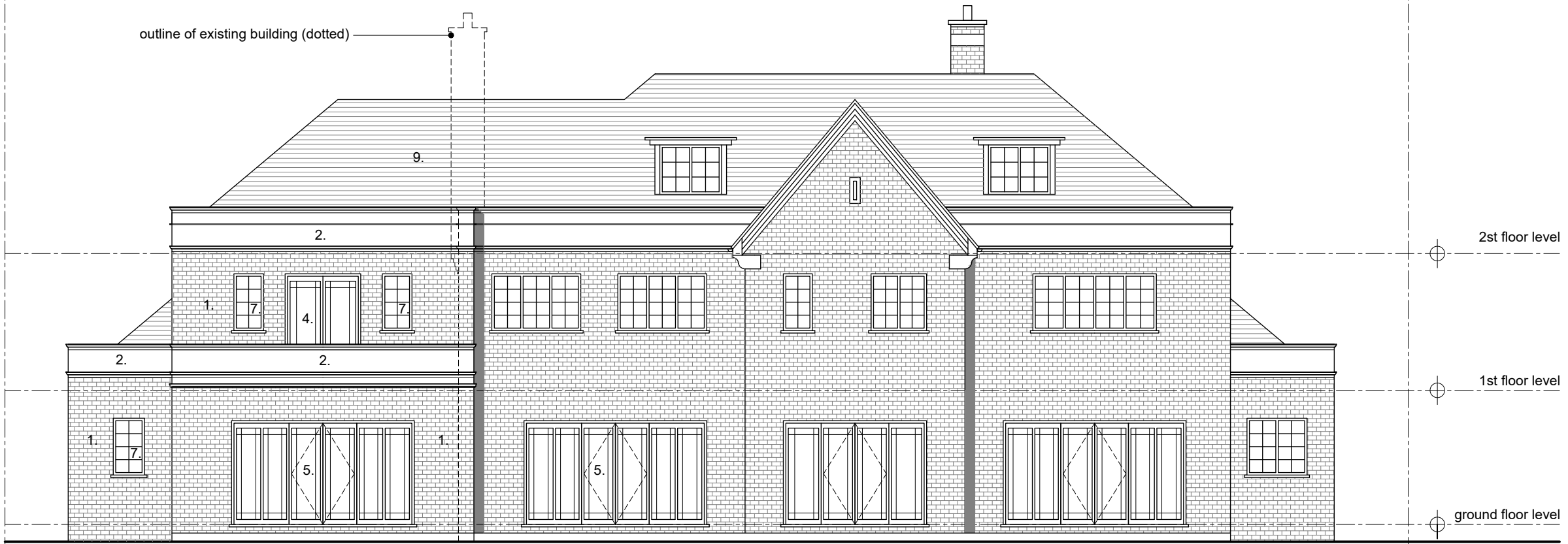
South (Rear) Elevation