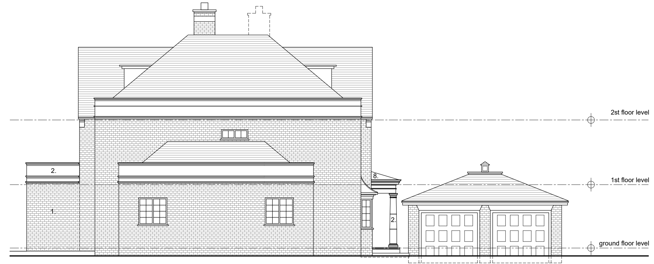
West (Side) Elevation