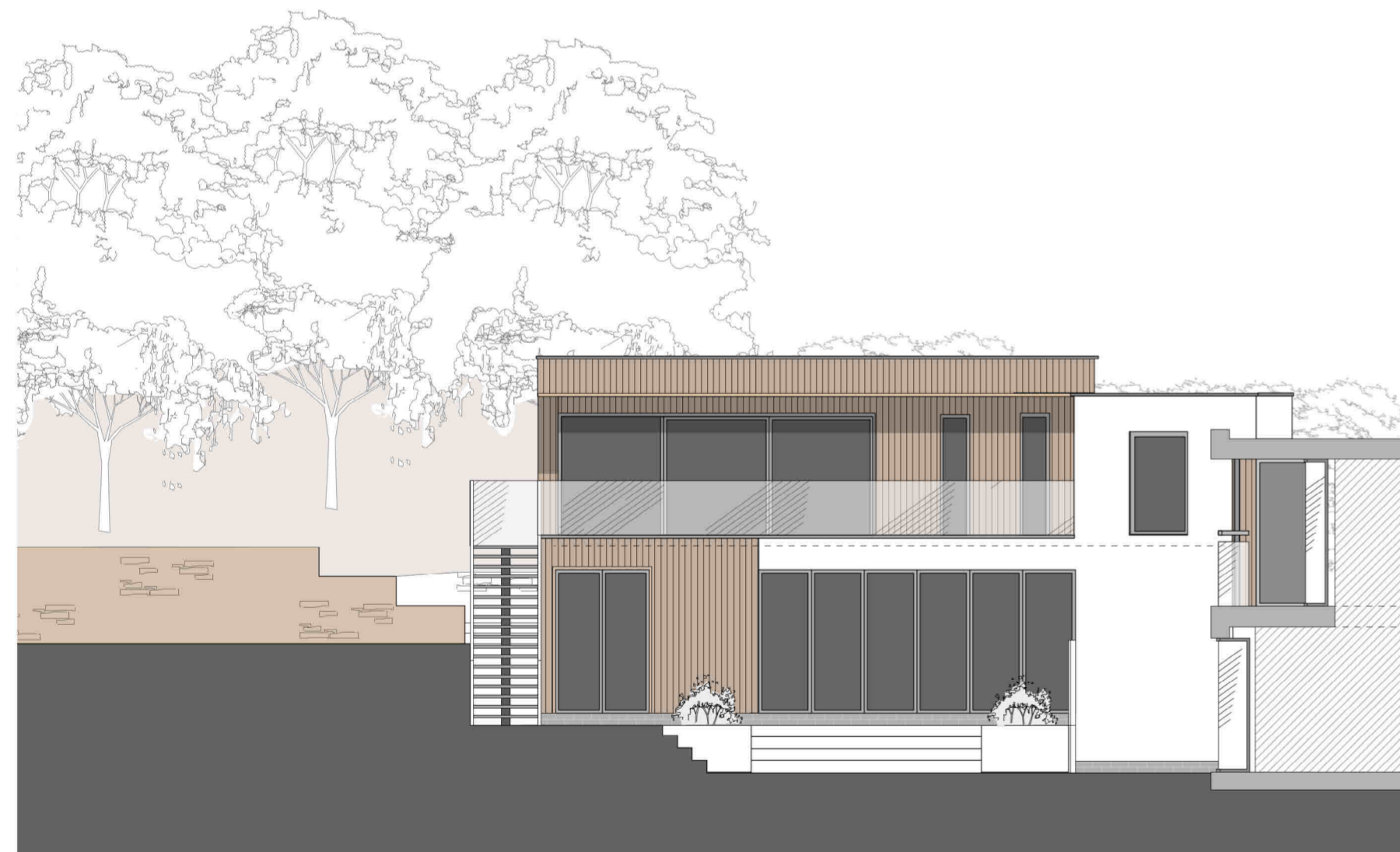
2 East - Sectional Elevation Scale: 1:100 @A1, 1:200 @A3