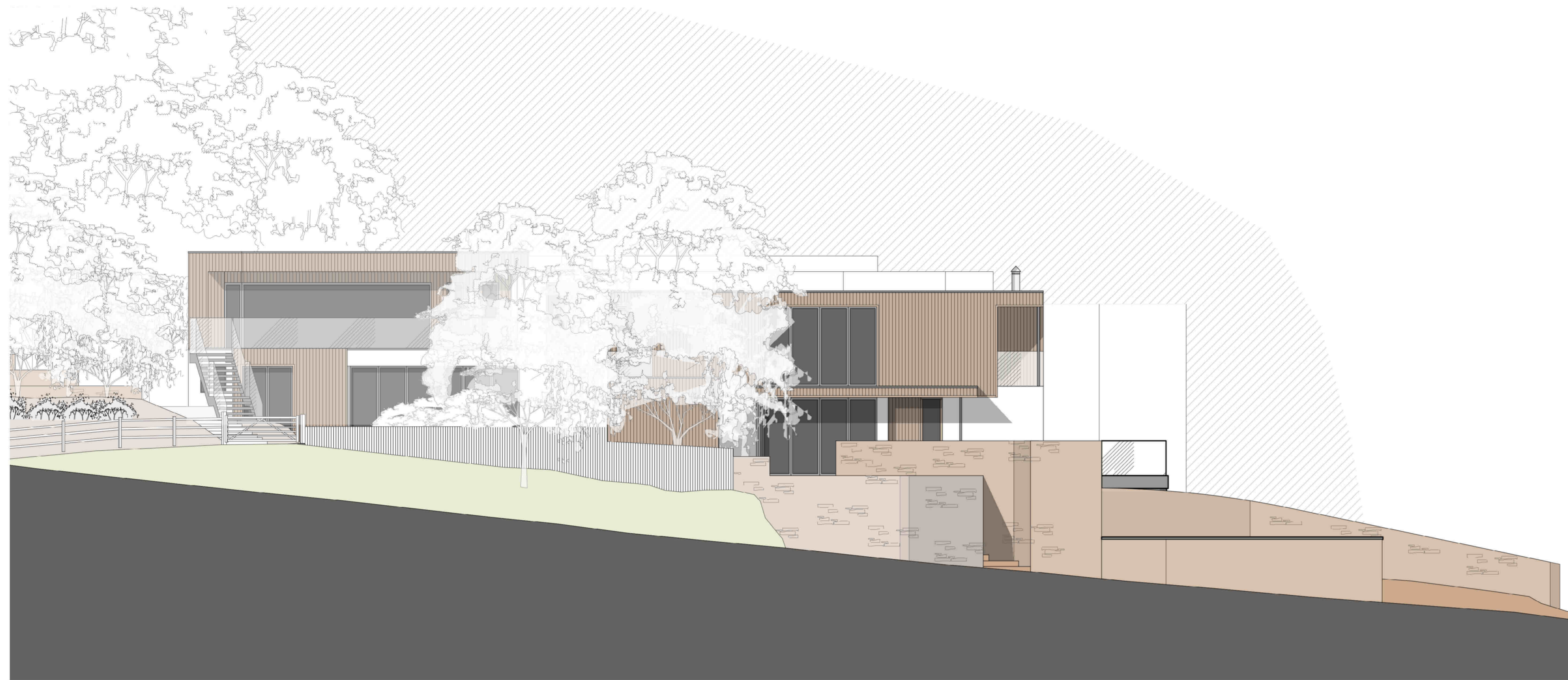
1 East - Context Elevation Scale: 1:100 @A1, 1:200 @A3