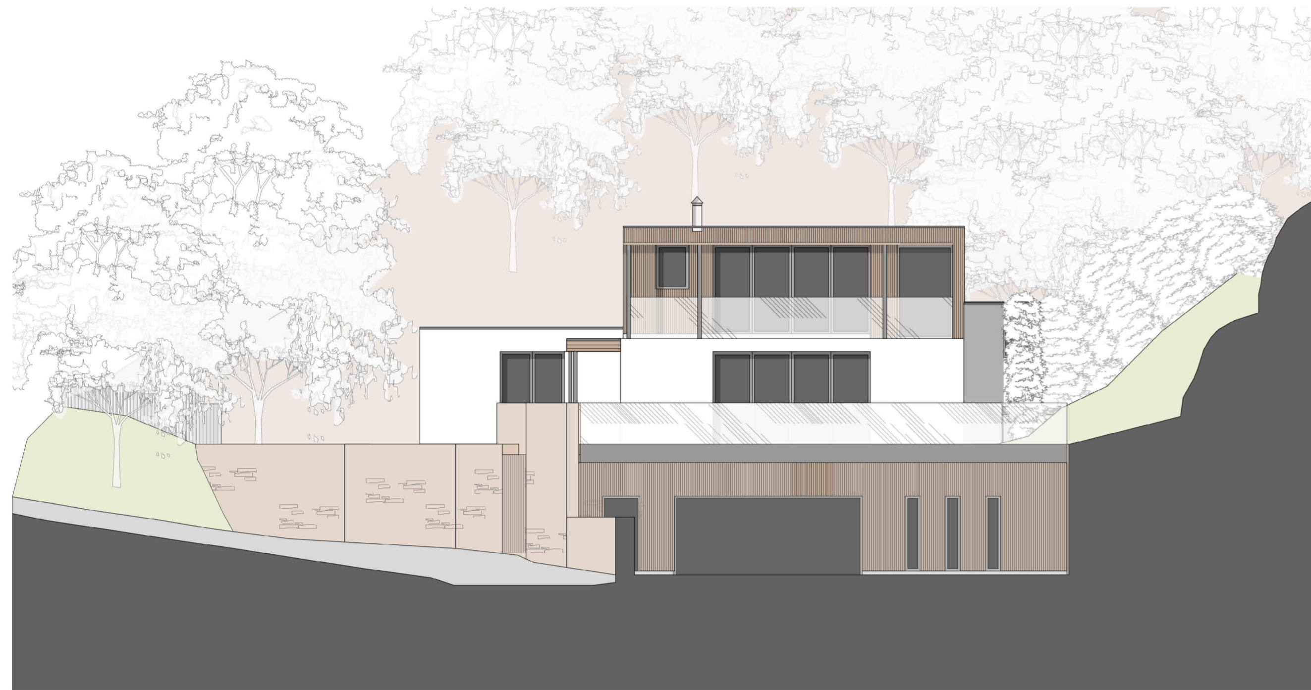
4 North Elevation Scale: 1:100 @A1, 1:200 @A3