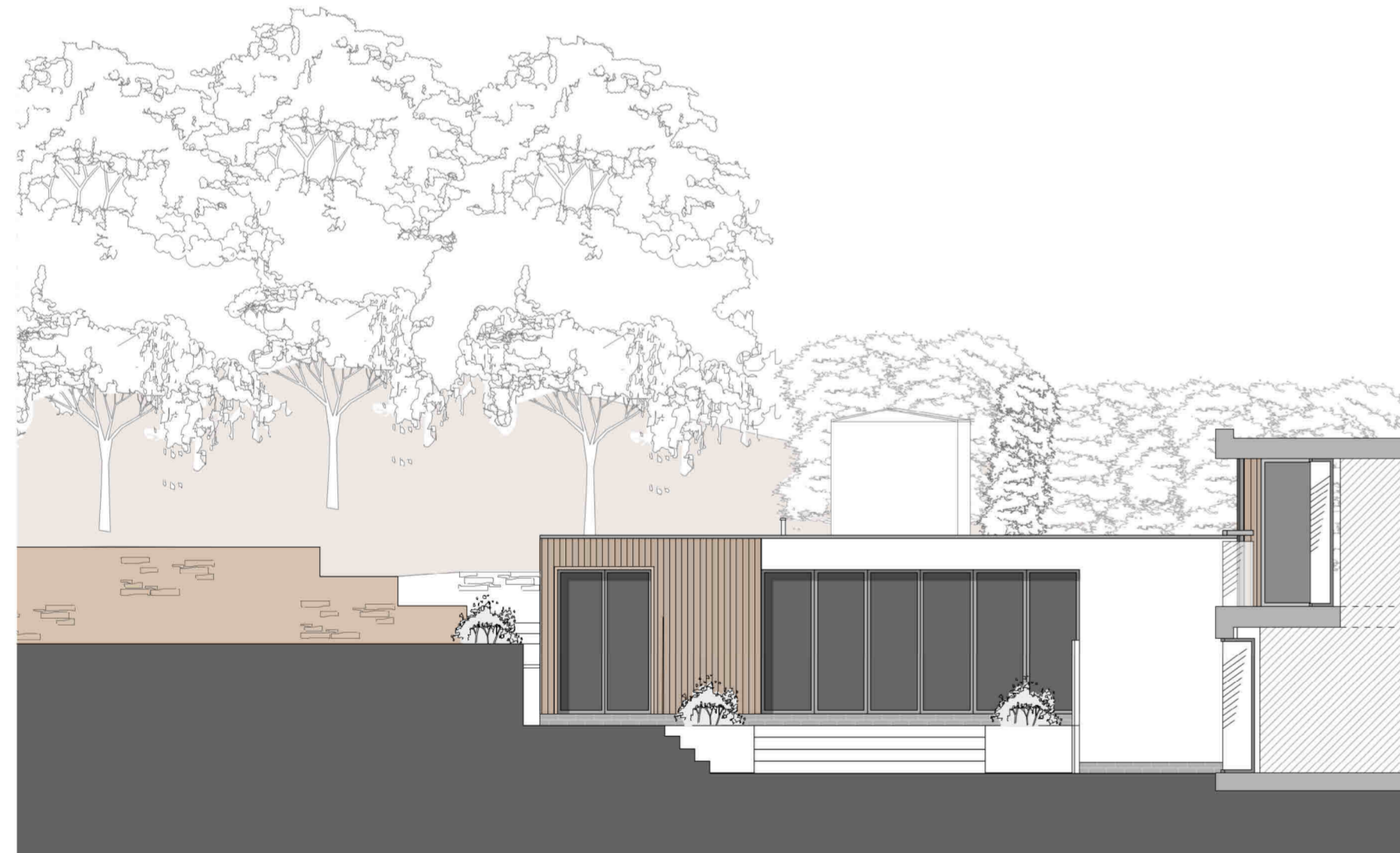
2 East - Sectional Elevation Scale: 1:100 @A1, 1:200 @A3