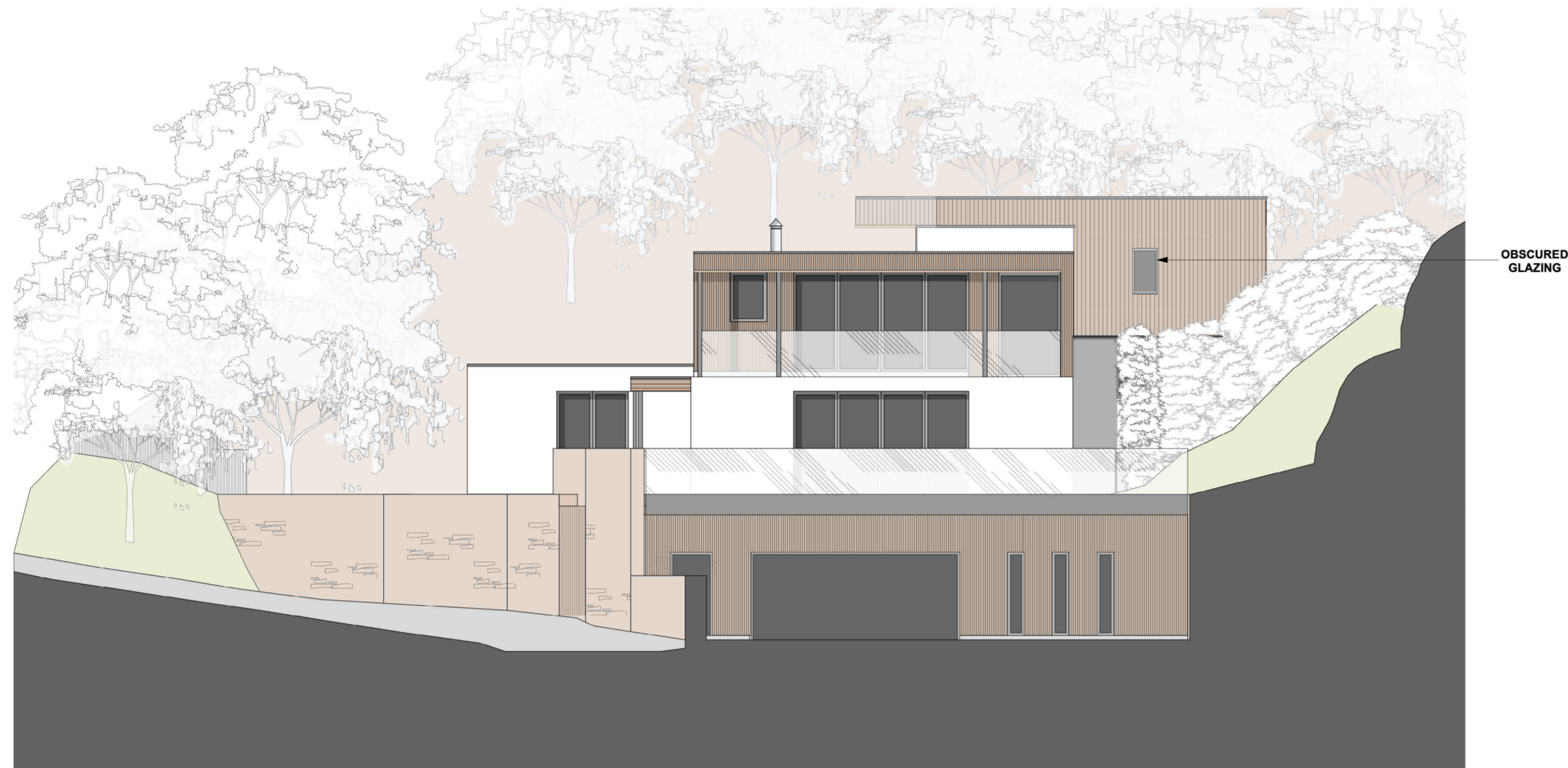
4 North Elevation Scale: 1:100 @A1, 1:200 @A3