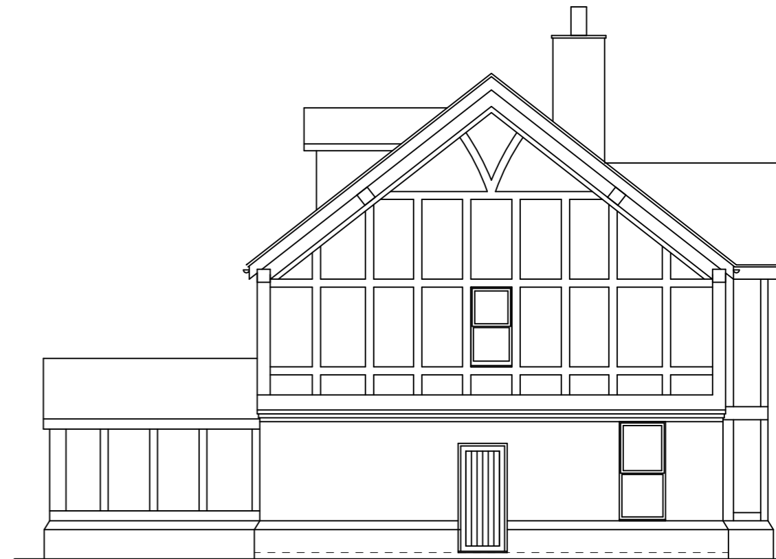
Existing Side Elevation Scale: 1:100

DO NOT SCALE FROM DRAWING. ALL DIMENSIONS TO BE CHECKED ON SITE PRIOR TO ANY WORK. DRAWINGS ARE NOT TO BE USED FOR CONSTRUCTION PURPOSES.