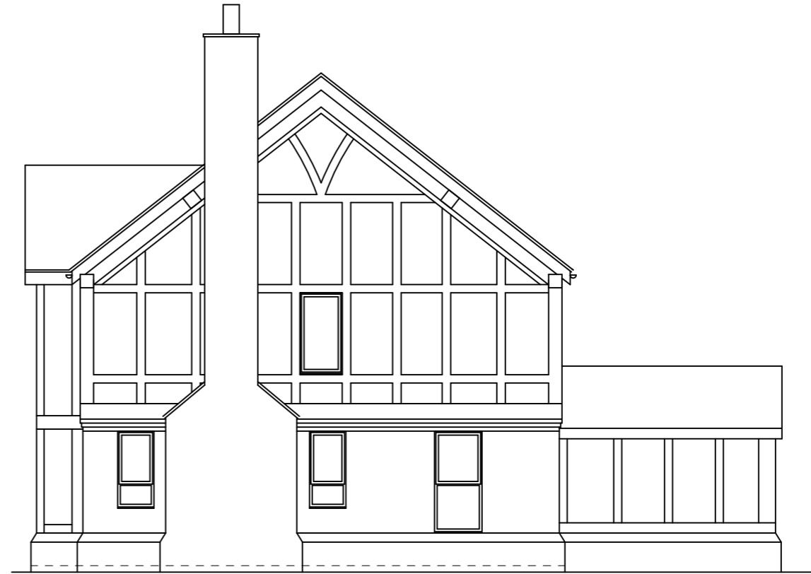
Existing Side Elevation Scale: 1:100