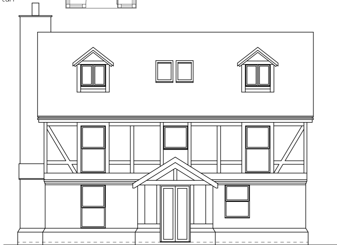
Existing Rear Elevation Scale: 1:100