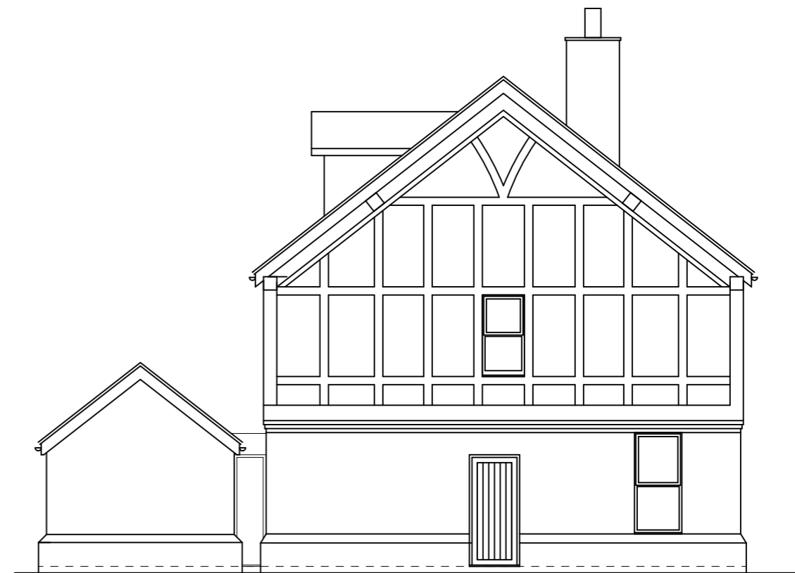
Proposed Side Elevation Scale: 1:100

DO NOT SCALE FROM DRAWING. ALL DIMENSIONS TO BE CHECKED ON SITE PRIOR TO ANY WORK. DRAWINGS ARE NOT TO BE USED FOR CONSTRUCTION PURPOSES.