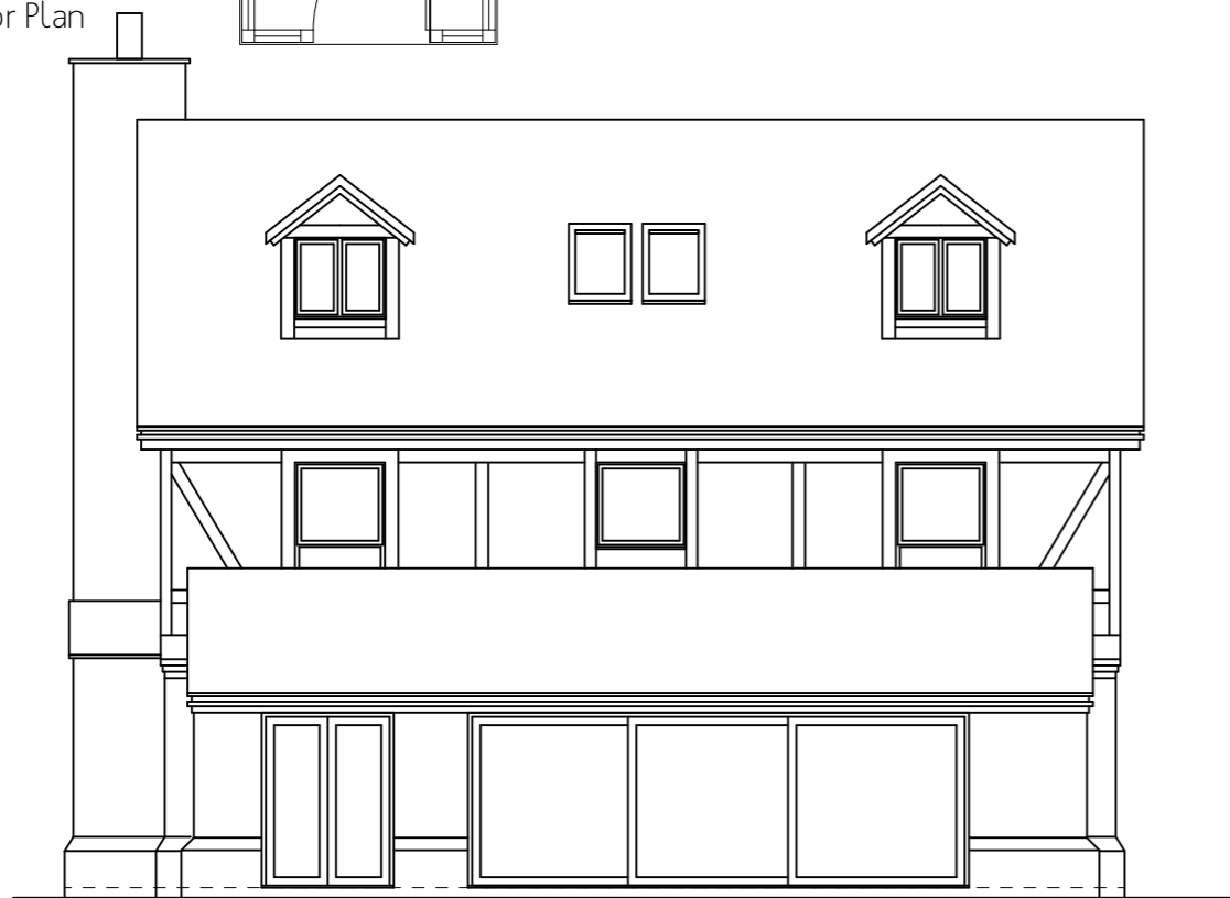
Proposed Rear Elevation Scale: 1:100