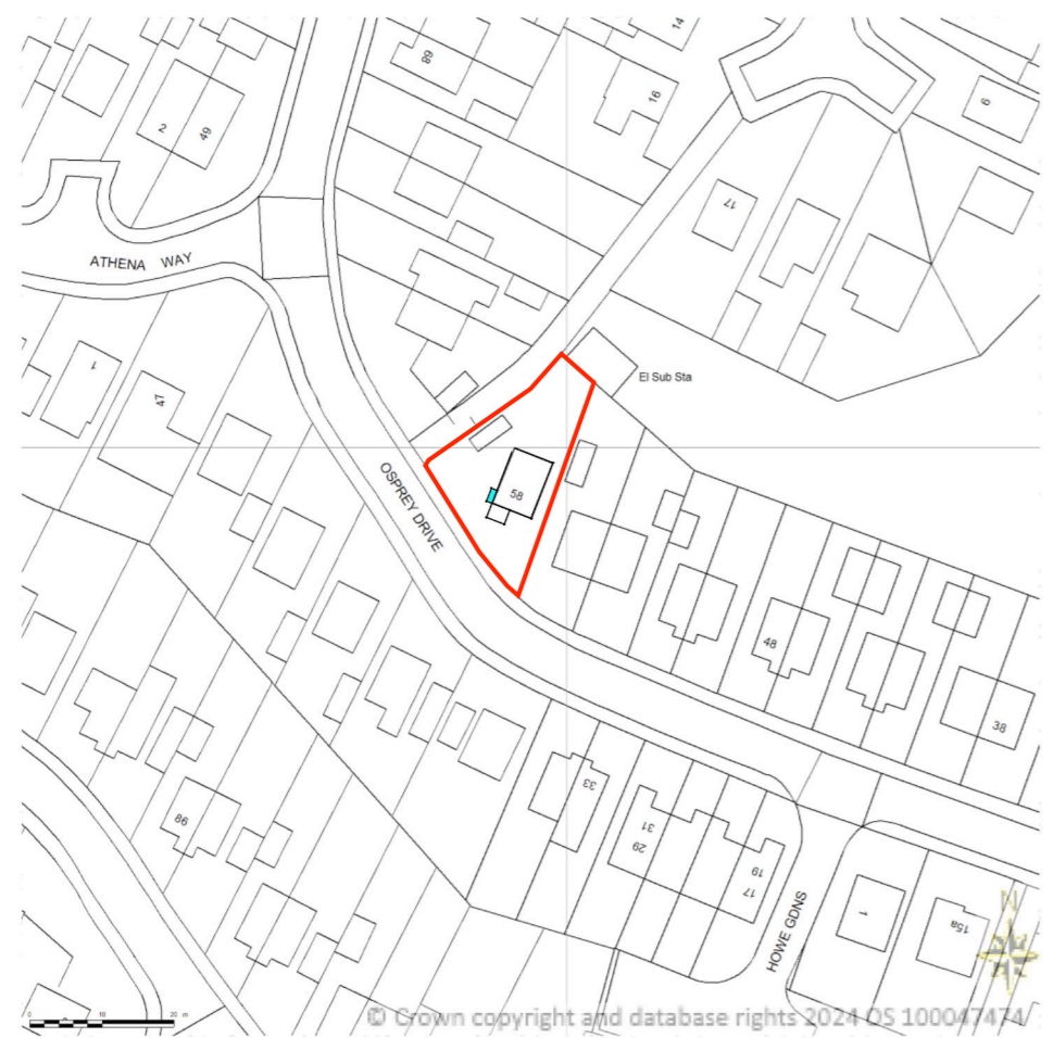
P LOCATION PLAN 9 scale: 1:1250