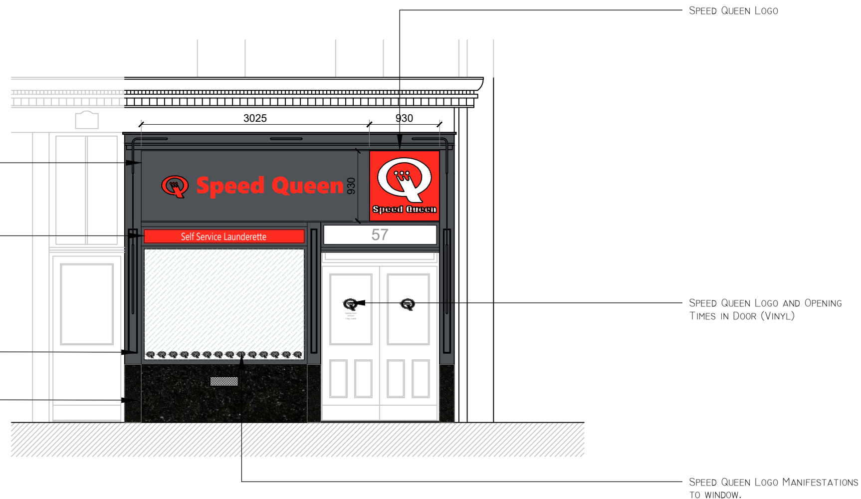
EXISTING FRONT ELEVATION 1.50 @ A3