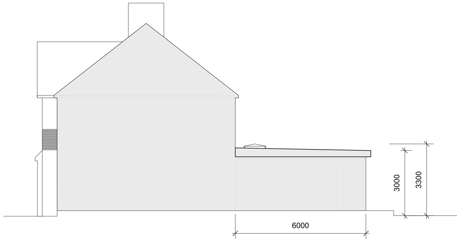
PROPOSED SIDE ELEVATION - VIEW FROM NEIGHBOUR NO 27 SCALE 1 : 100