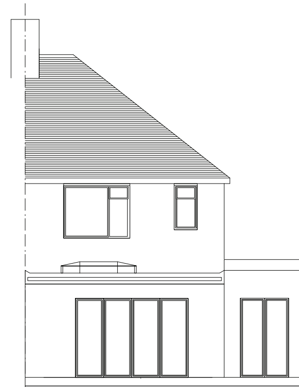
PROPOSED BACK ELEVATION SCALE 1 : 100