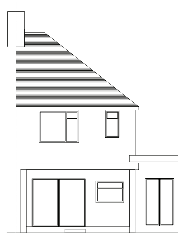
EXISTING GARDEN ELEVATION SCALE 1 : 100