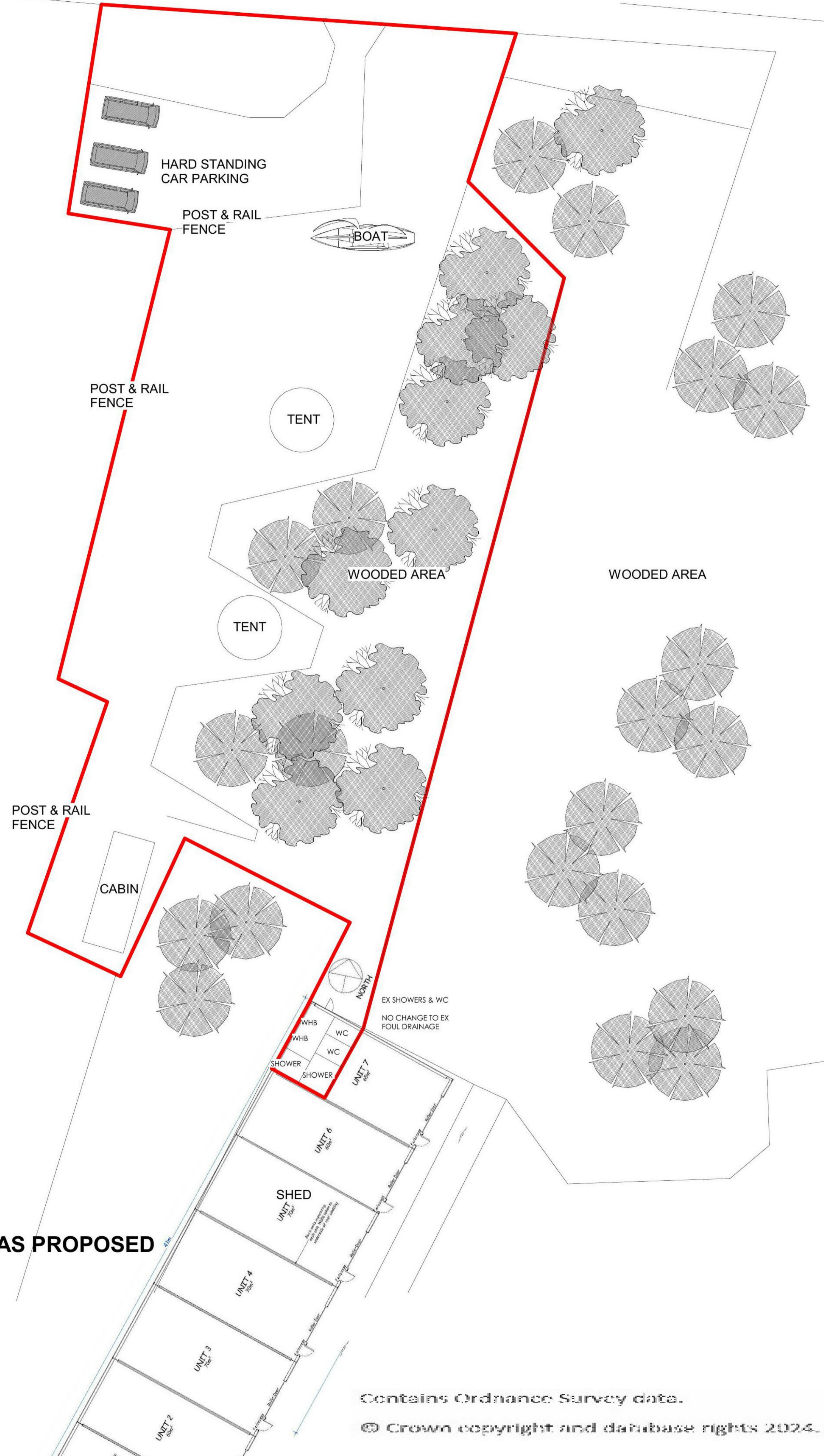
SITE PLAN - AS PROPOSED 1 : 200