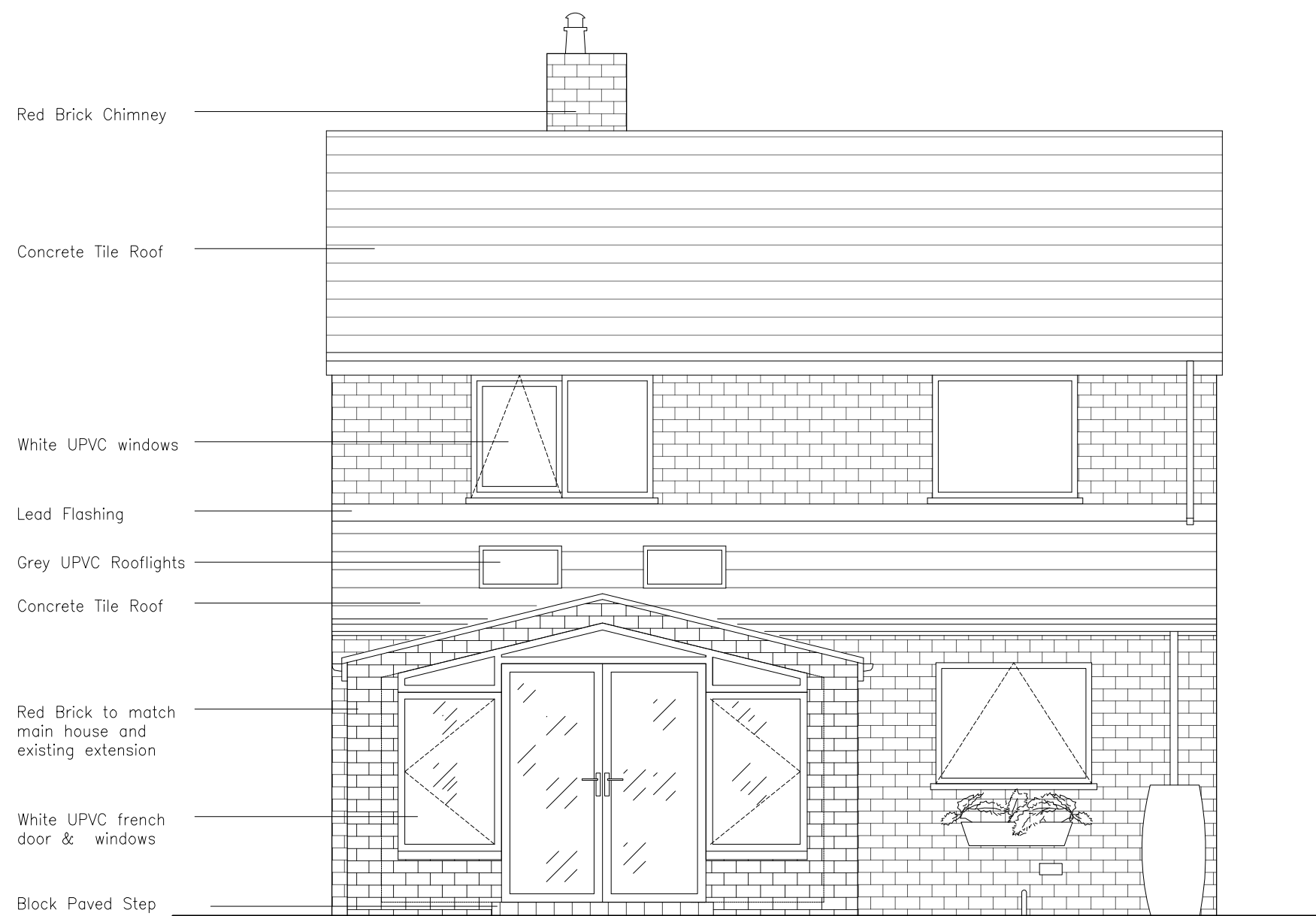
North Elevation Scale: 1:50