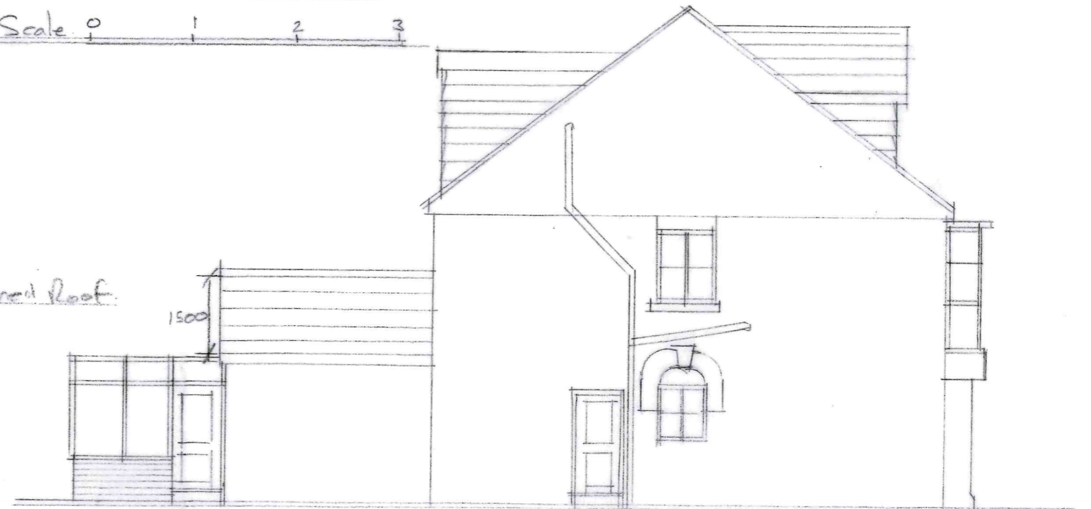
SIDE ELEVATION 1:100 @ A3 0 1 2 3 4 5