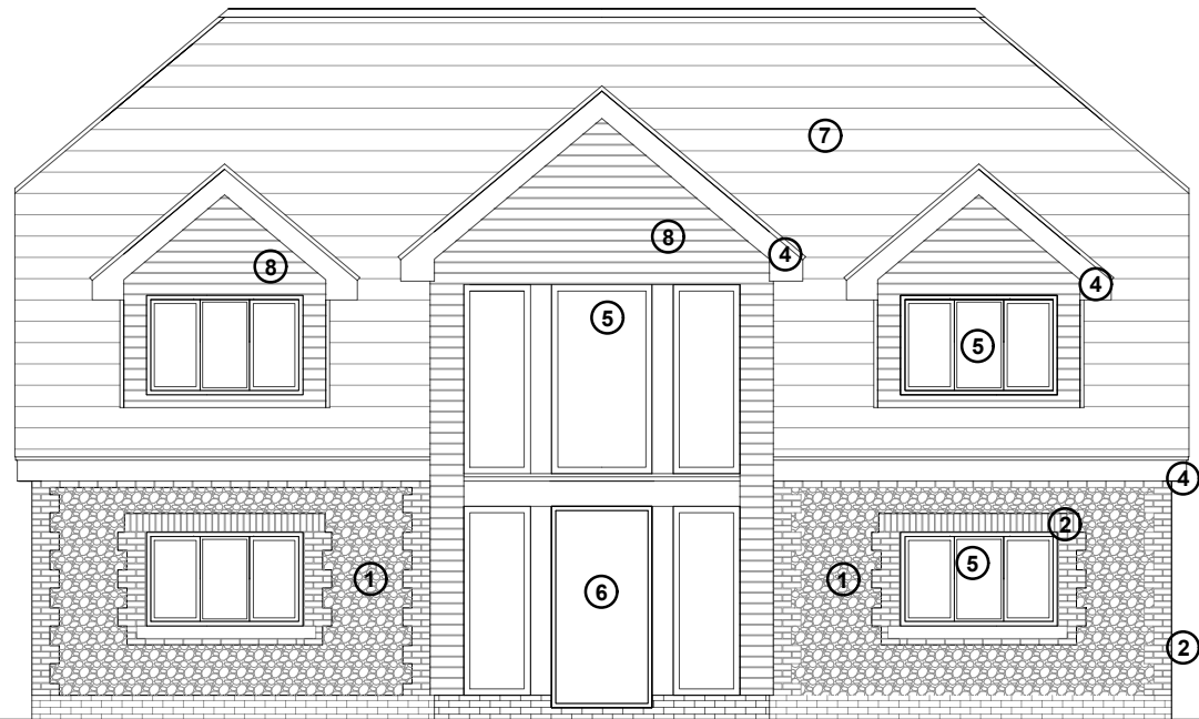
PROPOSED FRONT ELEVATION - SCALE 1:100

BUILDING REGULATIONS To Building regulation and British Standard. Requirements in all respects. To Fire Officer requirements in all respects. The Building Contractor must include for all works required by the M&E Contractors.