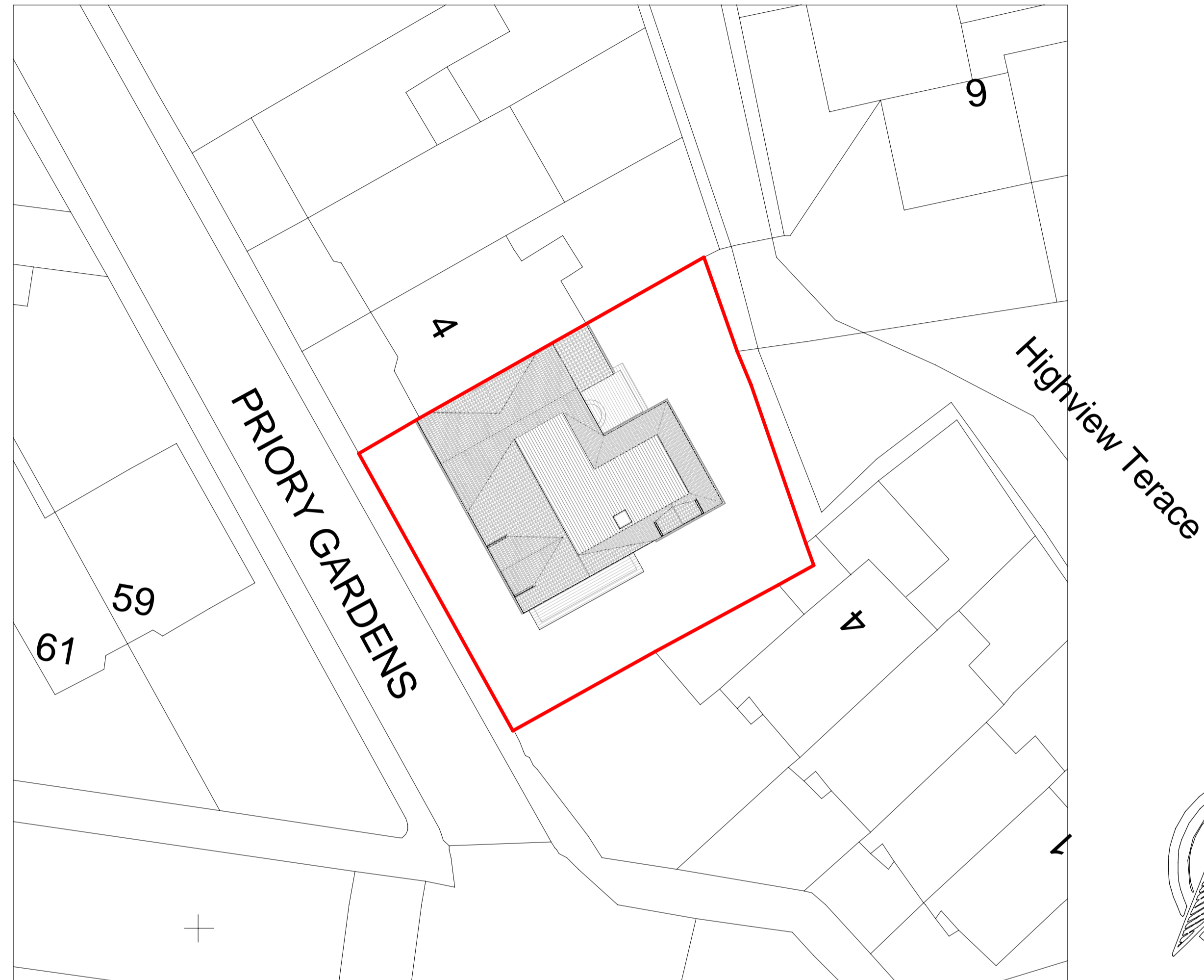
2 Existing Block Plan 1 : 200