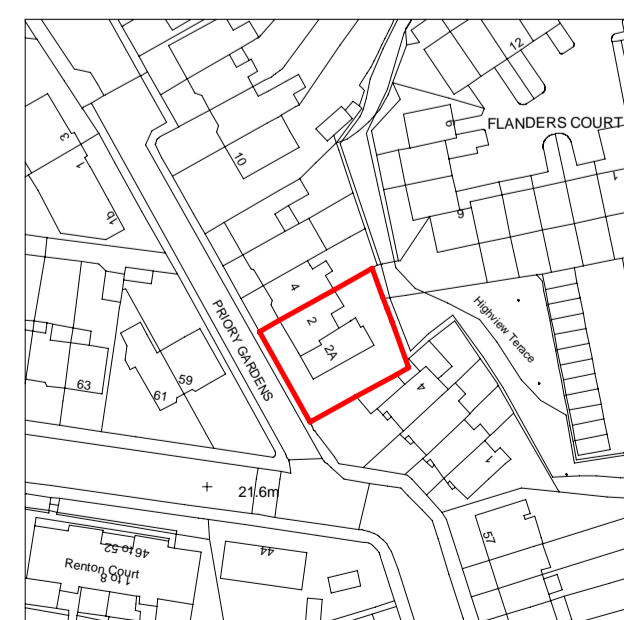
1 Location Plan 1 : 1250

Total Site Boundary Area = 344.3 m 2 Building No.2 Footprint Area = 60 m 2 Building No.2A Footprint Area = 58 m 2