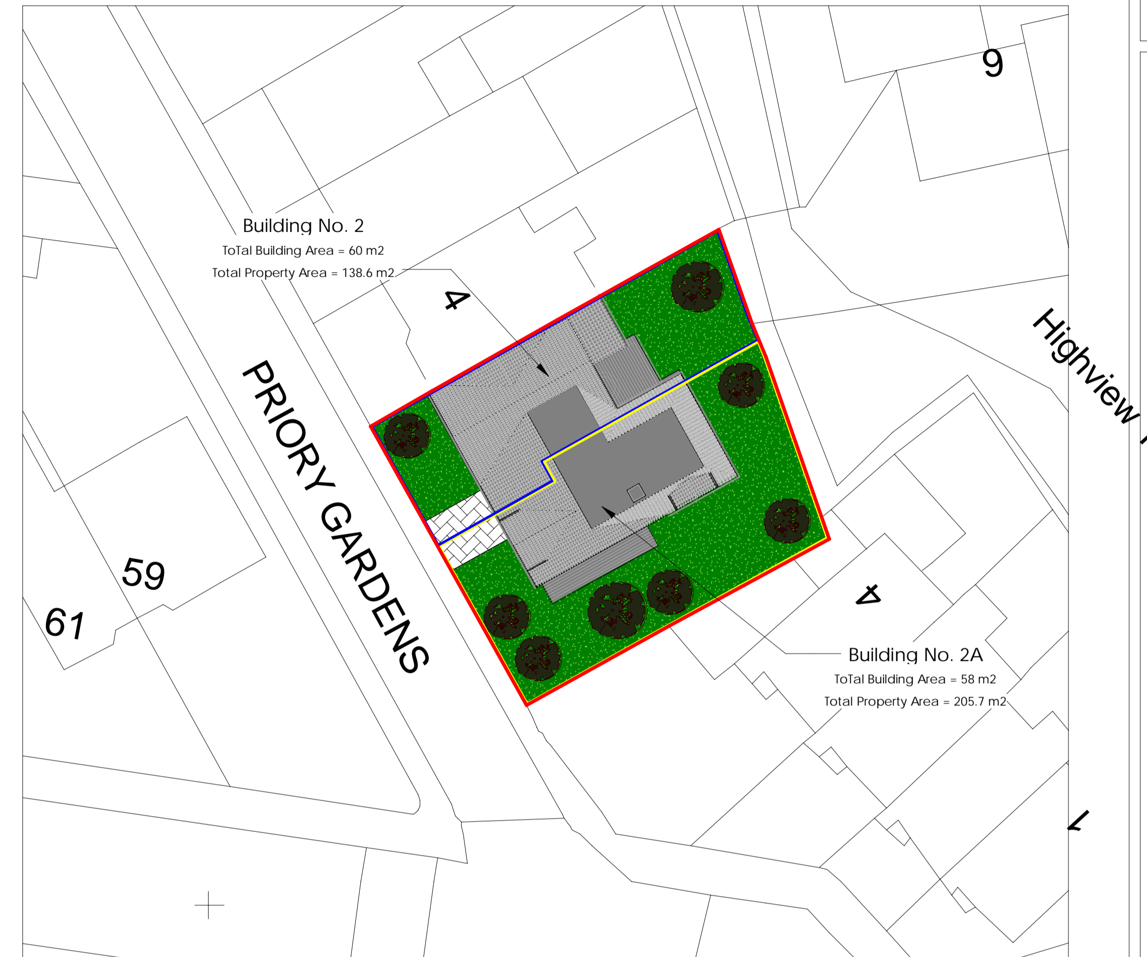
3 Proposed Block Plan 1 : 200