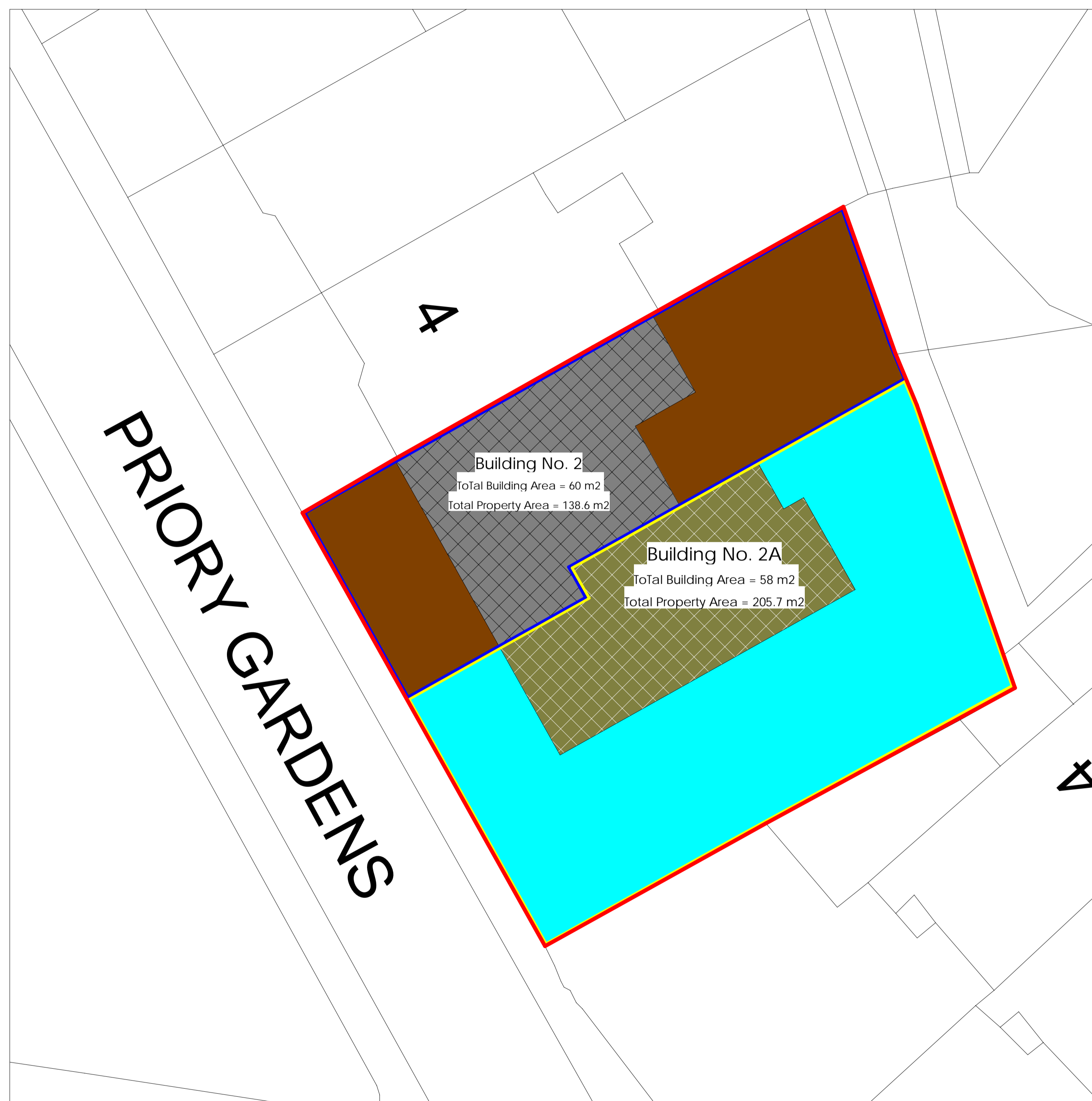
1 Proposed Site Division 1 : 100