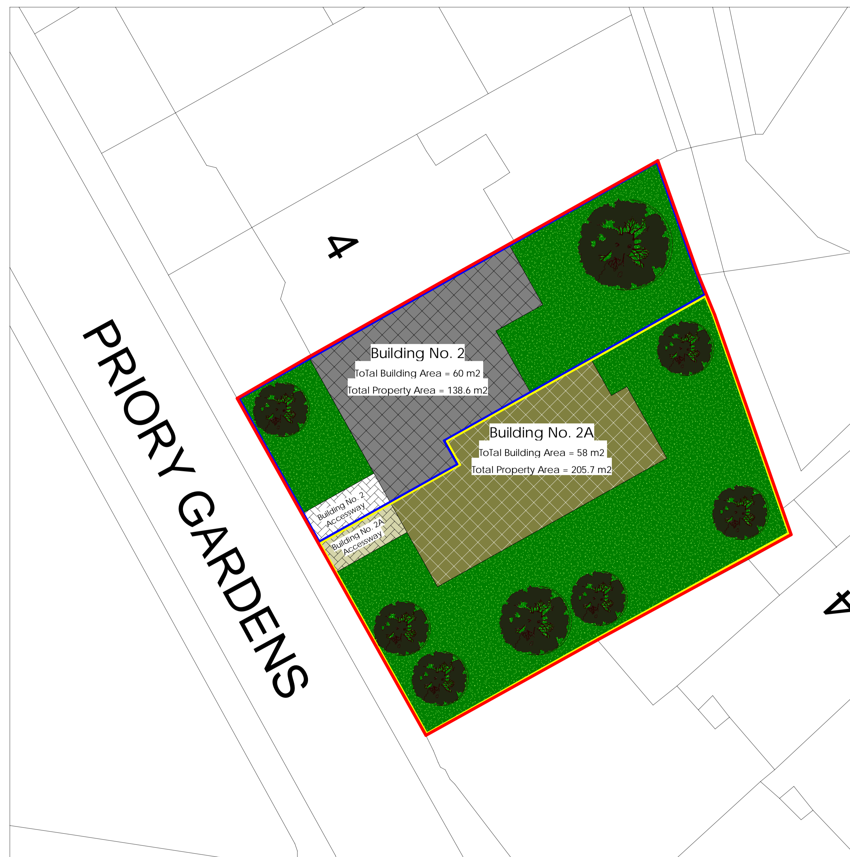
1 Proposed Master Plan 1 : 100