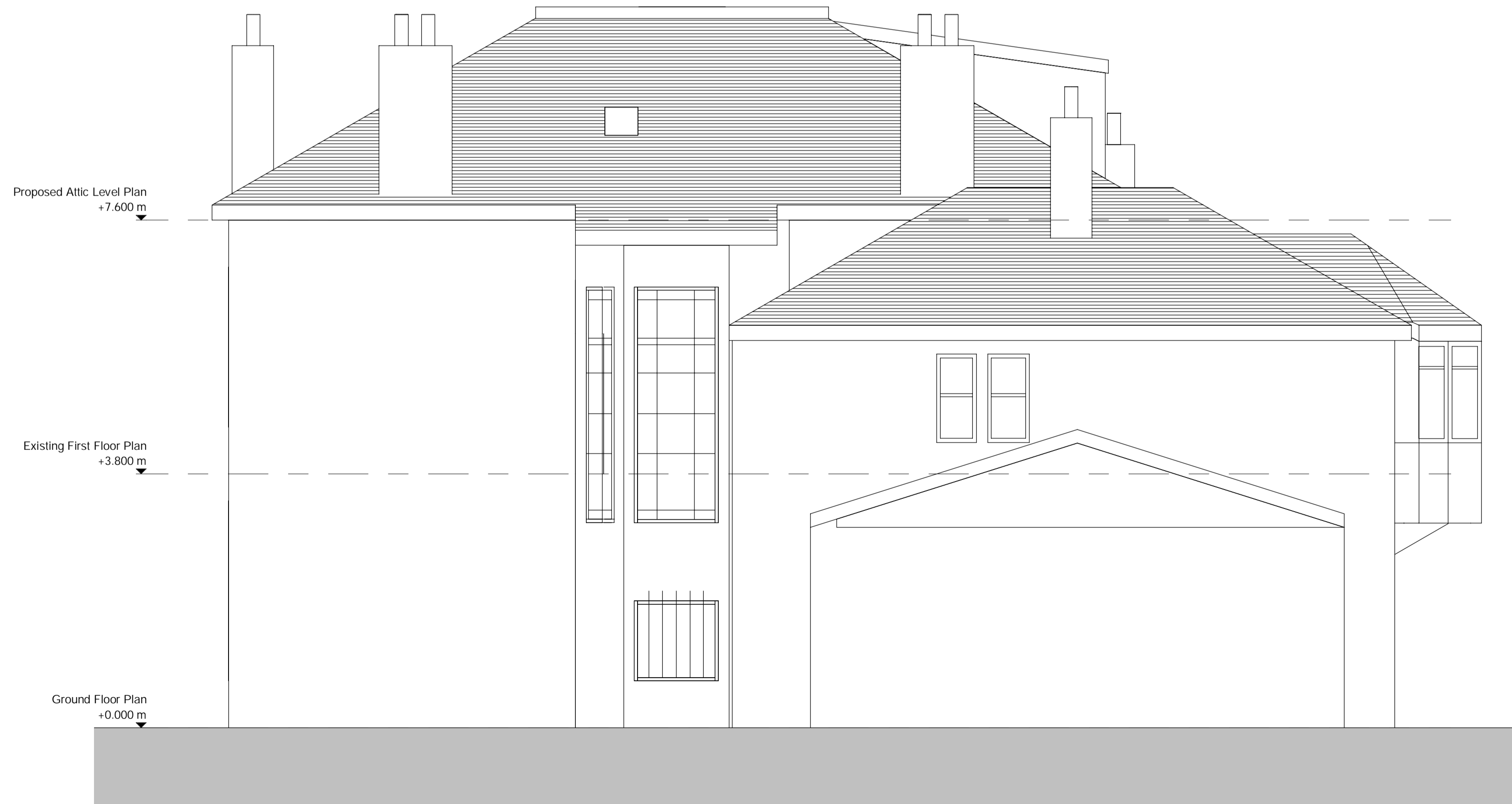
Existing Rear Elevation 1 : 50