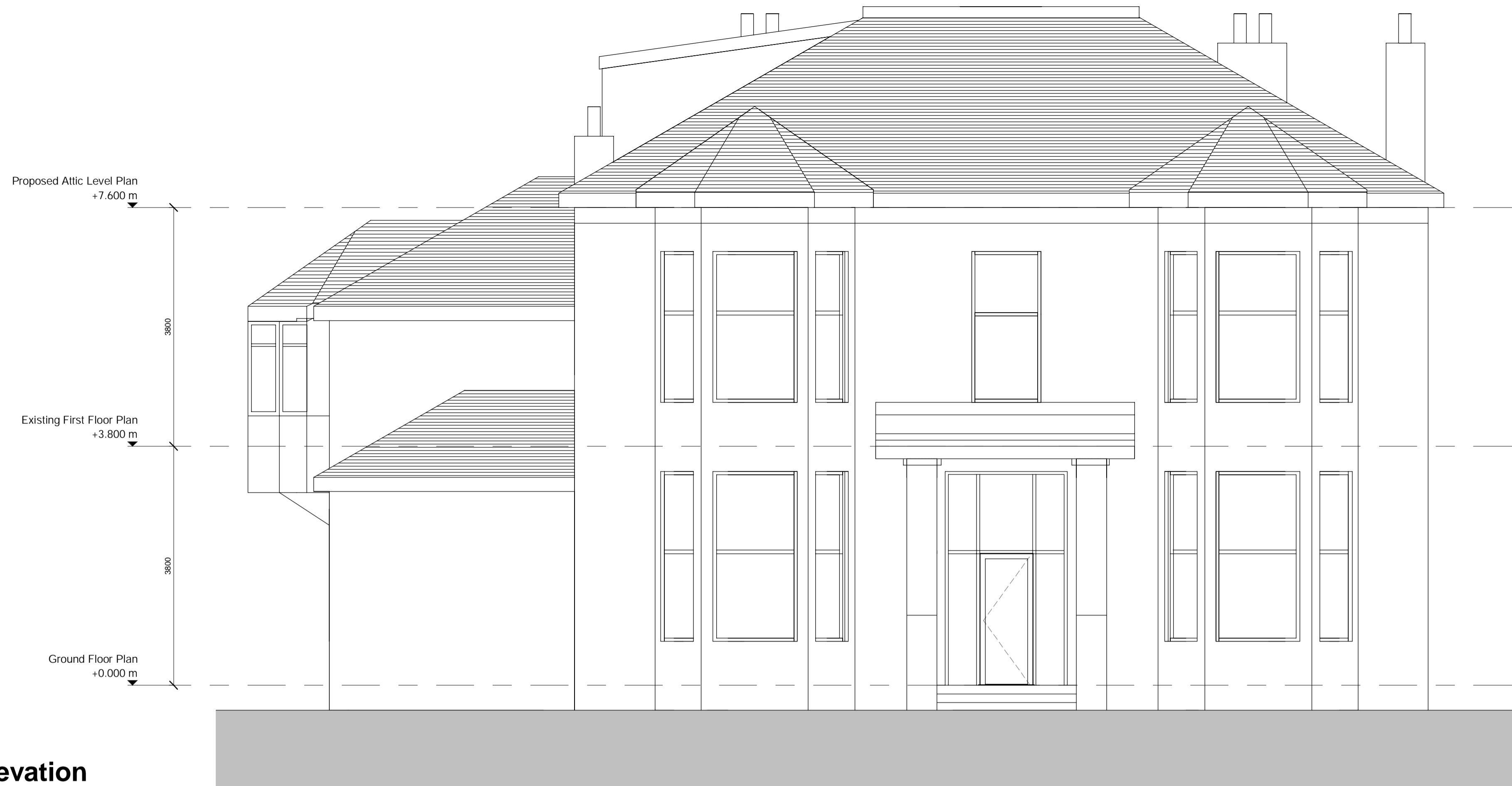
Existing Front Elevation 1 : 50