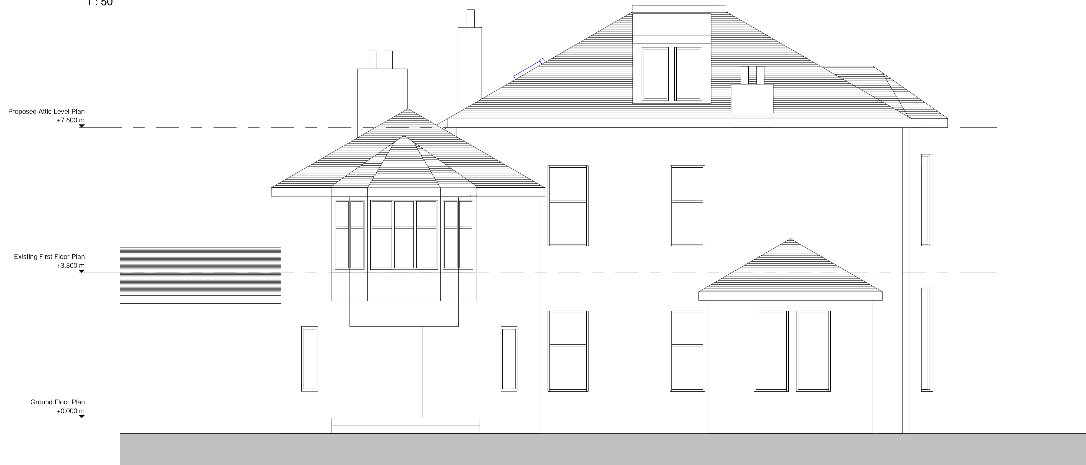
Proposed Side Elevation 2