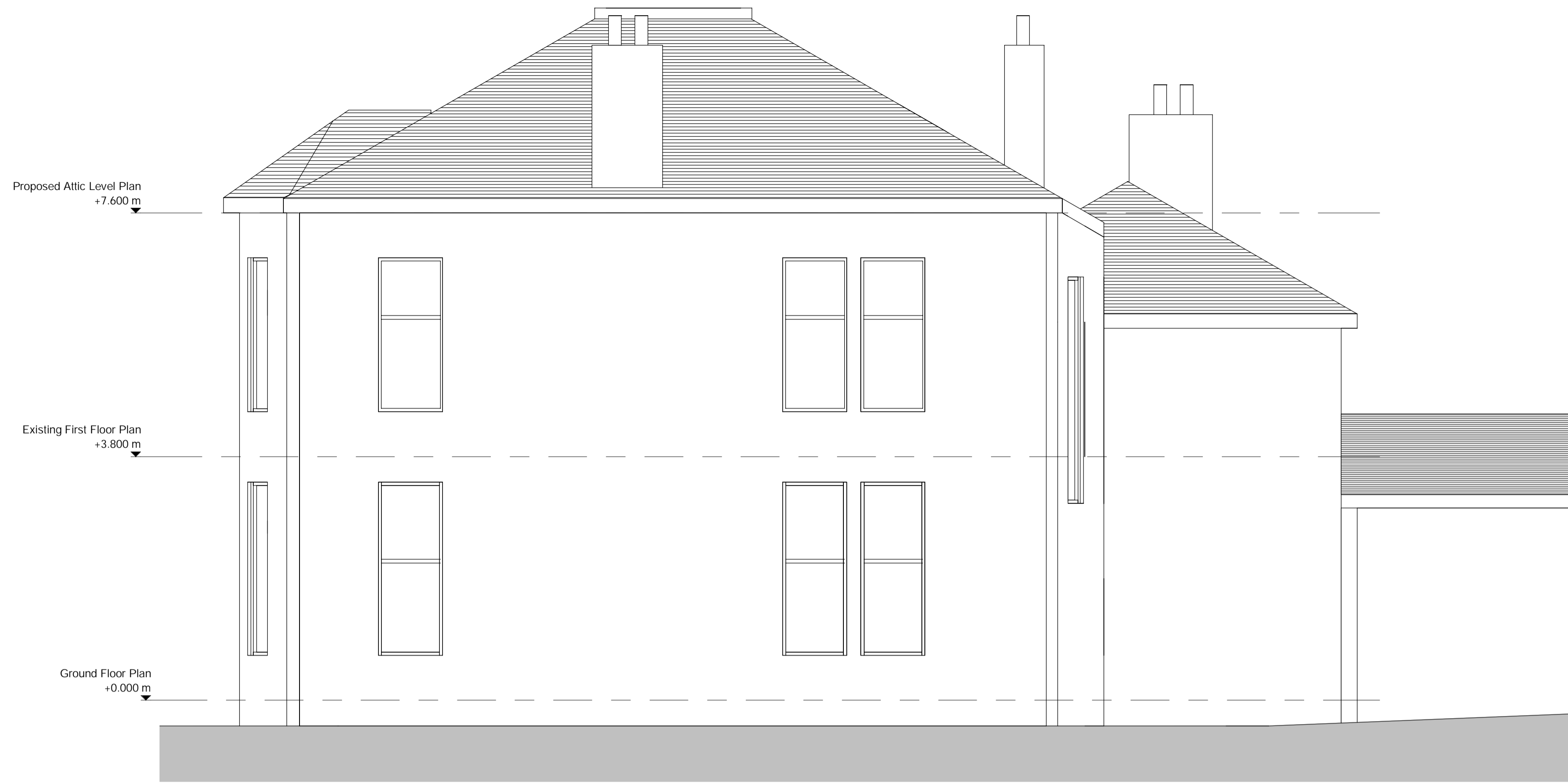
Existing Side Elevation 1 1 : 50

PLEASE REFER TO ALL CIVIL, STRUCTURAL AND M&E DRAWINGS AND SPECIFICATIONS IN CONJUNCTION WITH THIS DRAWING.