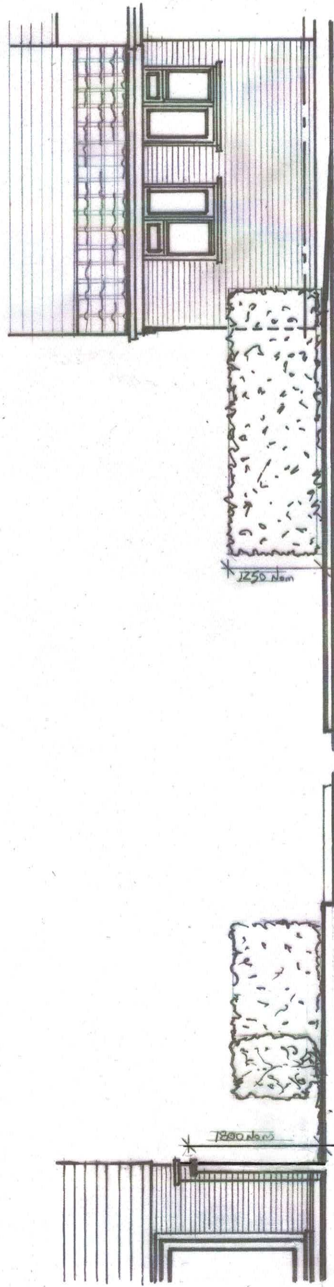
1 FRONT (south west) ELEVATION 1:50 as existing

This Drawing is the copyright of PDA Architects and may not be reproduced without prior written permission. Checked on site. All dimensions are to be reported to the architect. Any errors or omissions are to be reported to the architect.