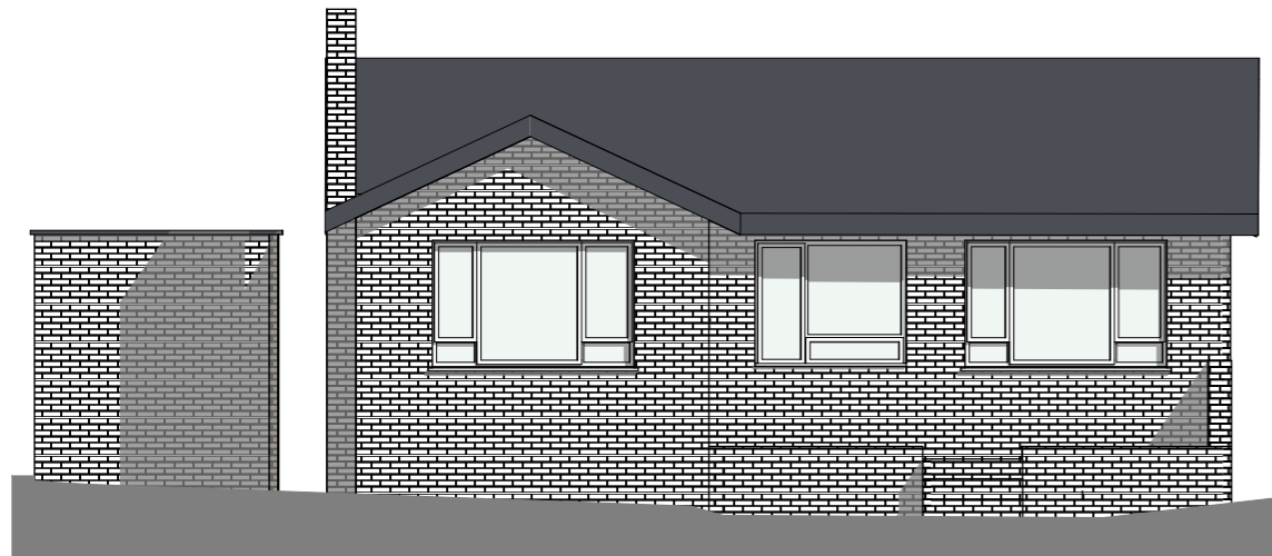
EXISTING REAR (WEST ELEVATION) 1:100