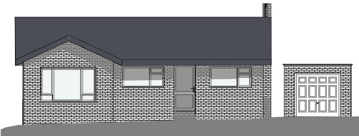
EXISTING FRONT (EAST) ELEVATION 1:100