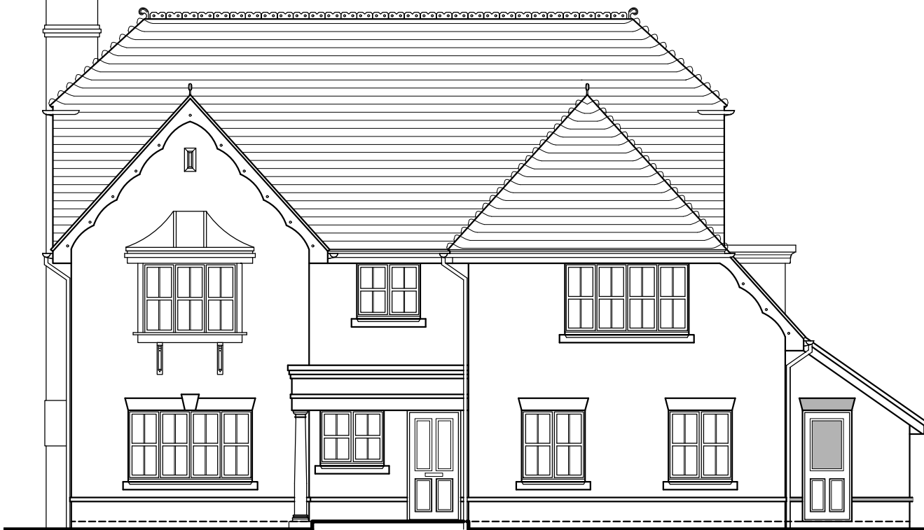
NORTH ELEVATION AS PROPOSED