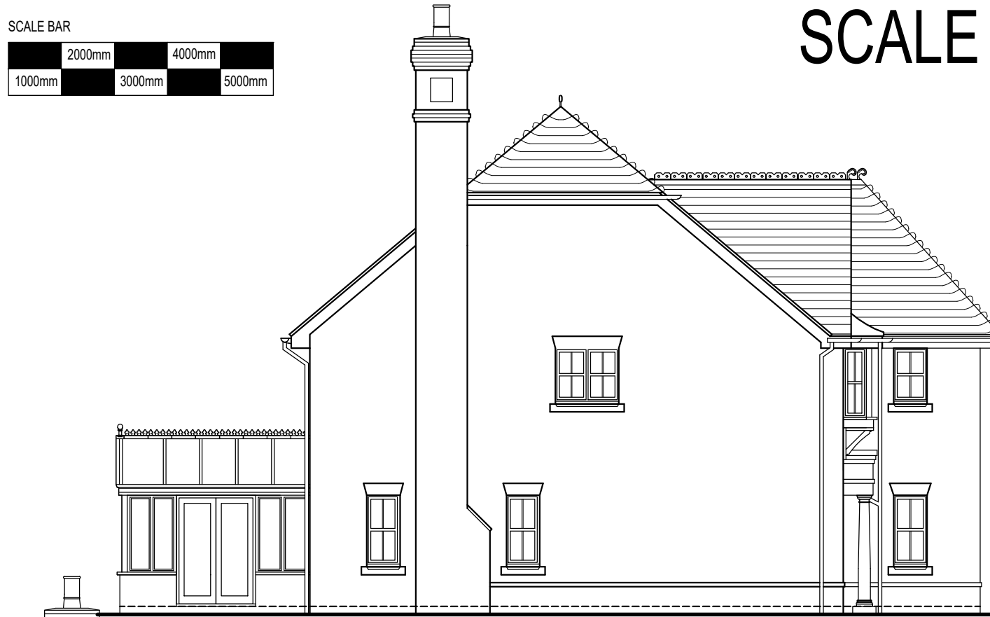
EAST ELEVATION AS PROPOSED

THIS DRAWING IS FOR PLANNING PURPOSES ONLY THIS DRAWING IS BASED UPON SURVEY INFORMATION DRAWN BY OTHERS. ALL CRITICAL DIMENSIONS TO BE CHECKED ON SITE.