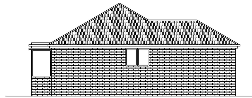
EXISTING END ELEVATION SCALE 1:100 AT A3