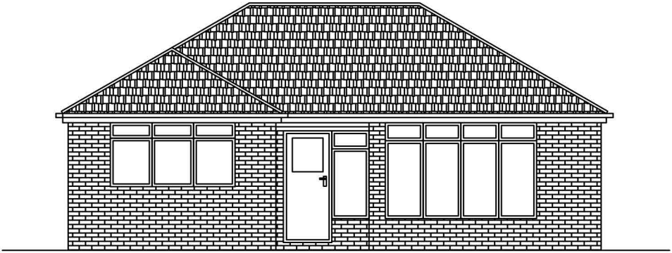
EXISTING FRONT ELEVATION SCALE 1:100 AT A3