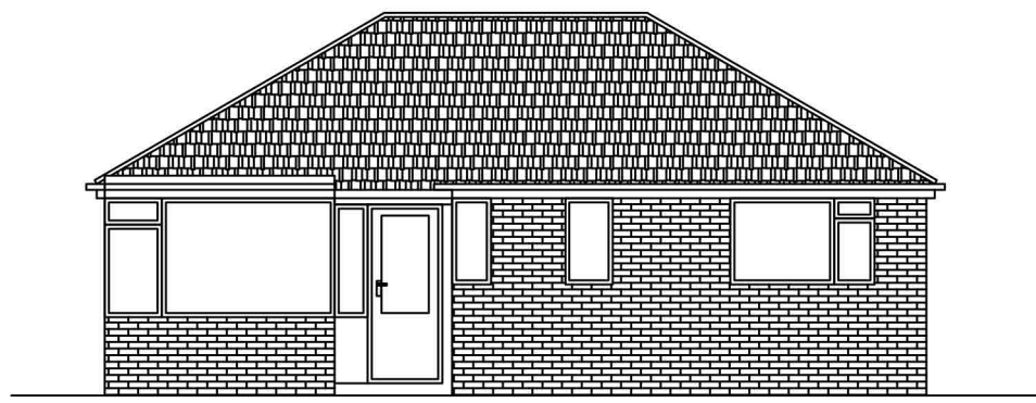
EXISTING REAR ELEVATION SCALE 1:100 AT A3