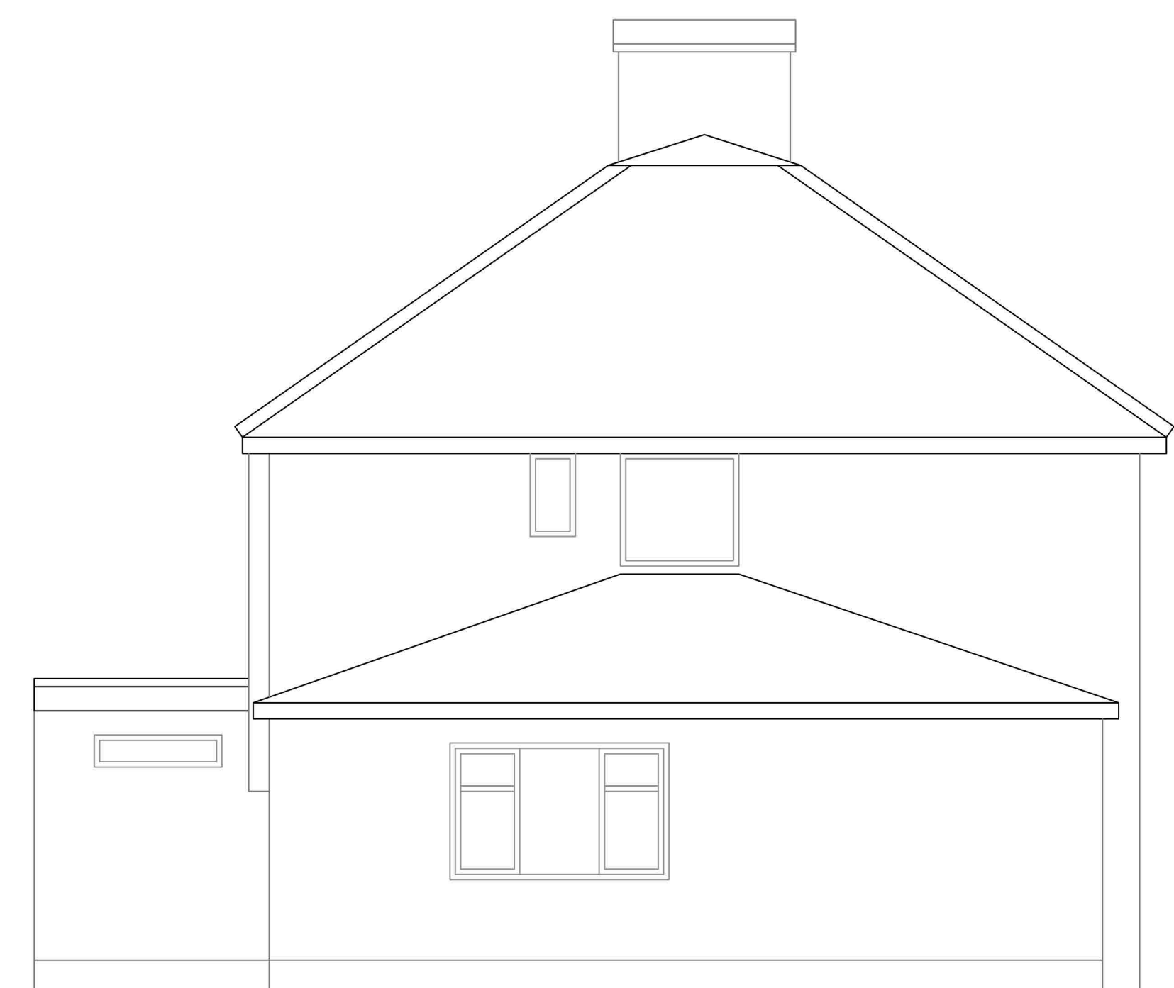
AS EXISTING SIDE ELEVATION 1:50 @ A1