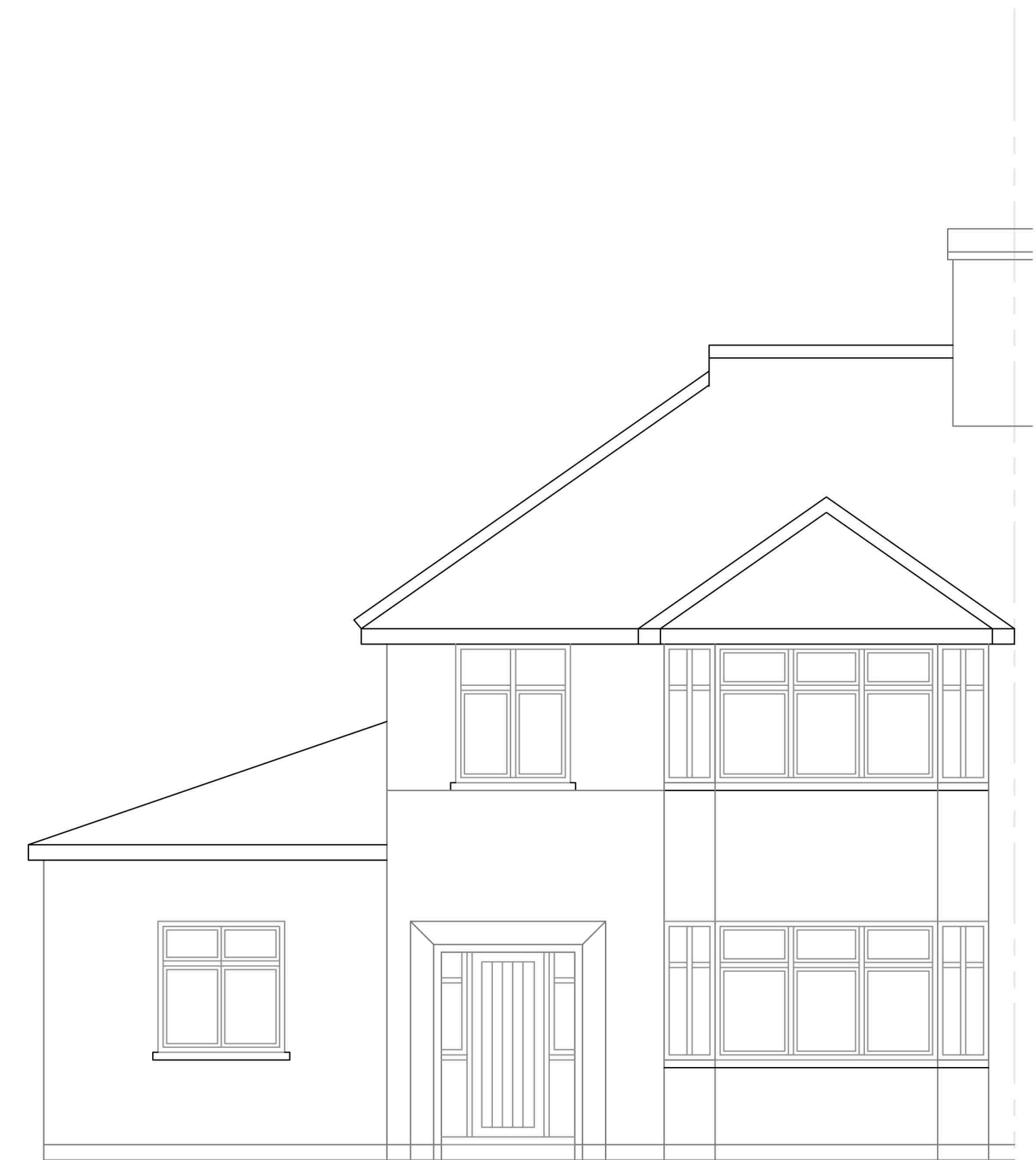
AS EXISTING FRONT ELEVATION 1:50 @ A1