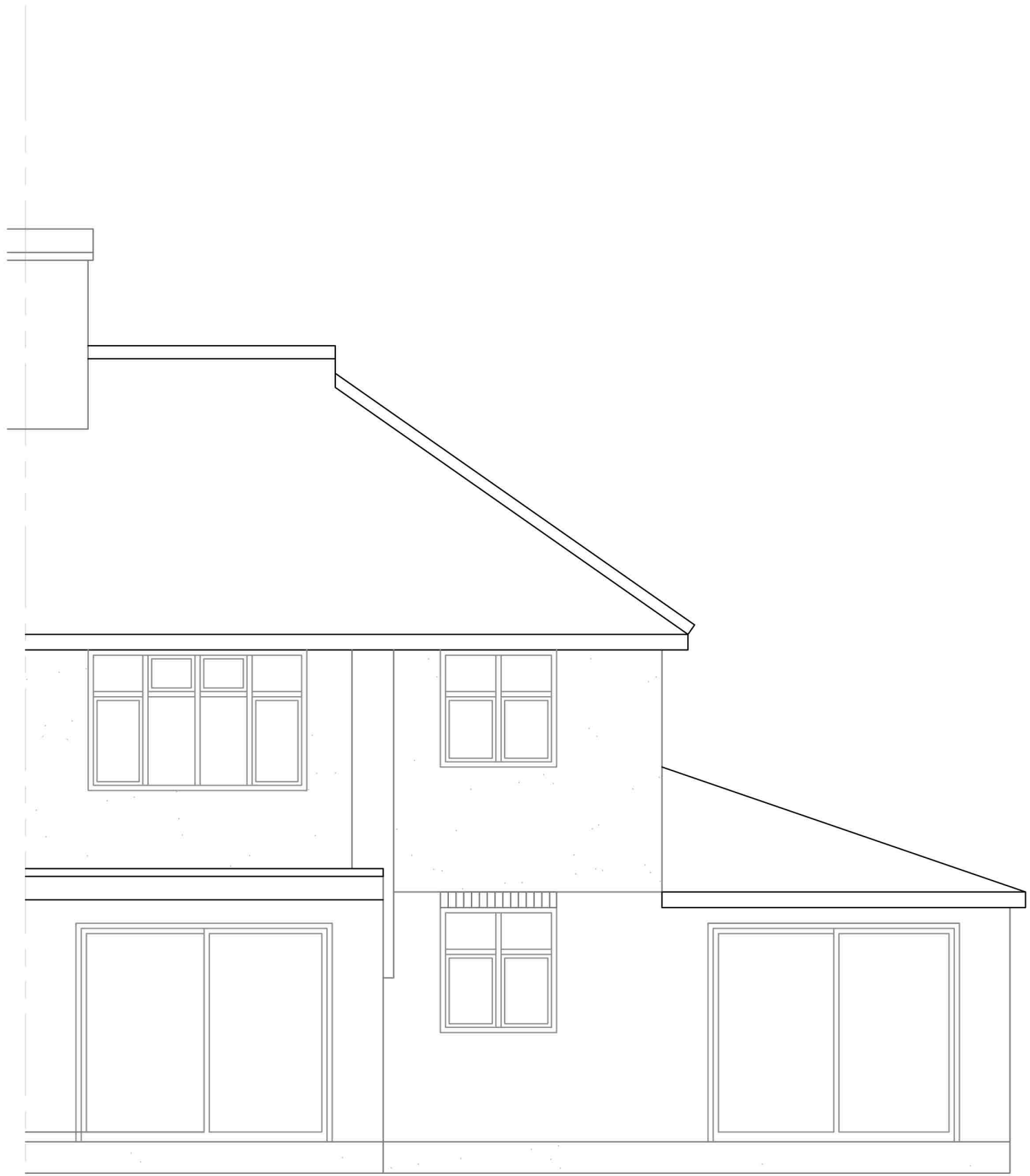
AS EXISTING REAR ELEVATION 1:50 @ A1