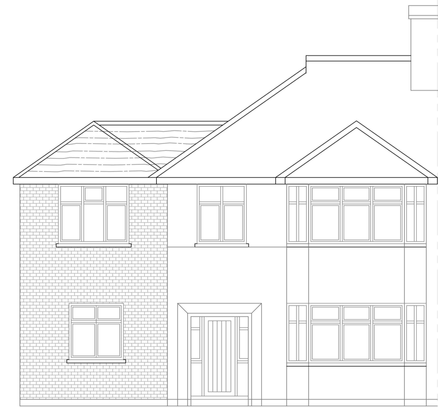
AS PROPOSED FRONT ELEVATION 1:50 @ A1