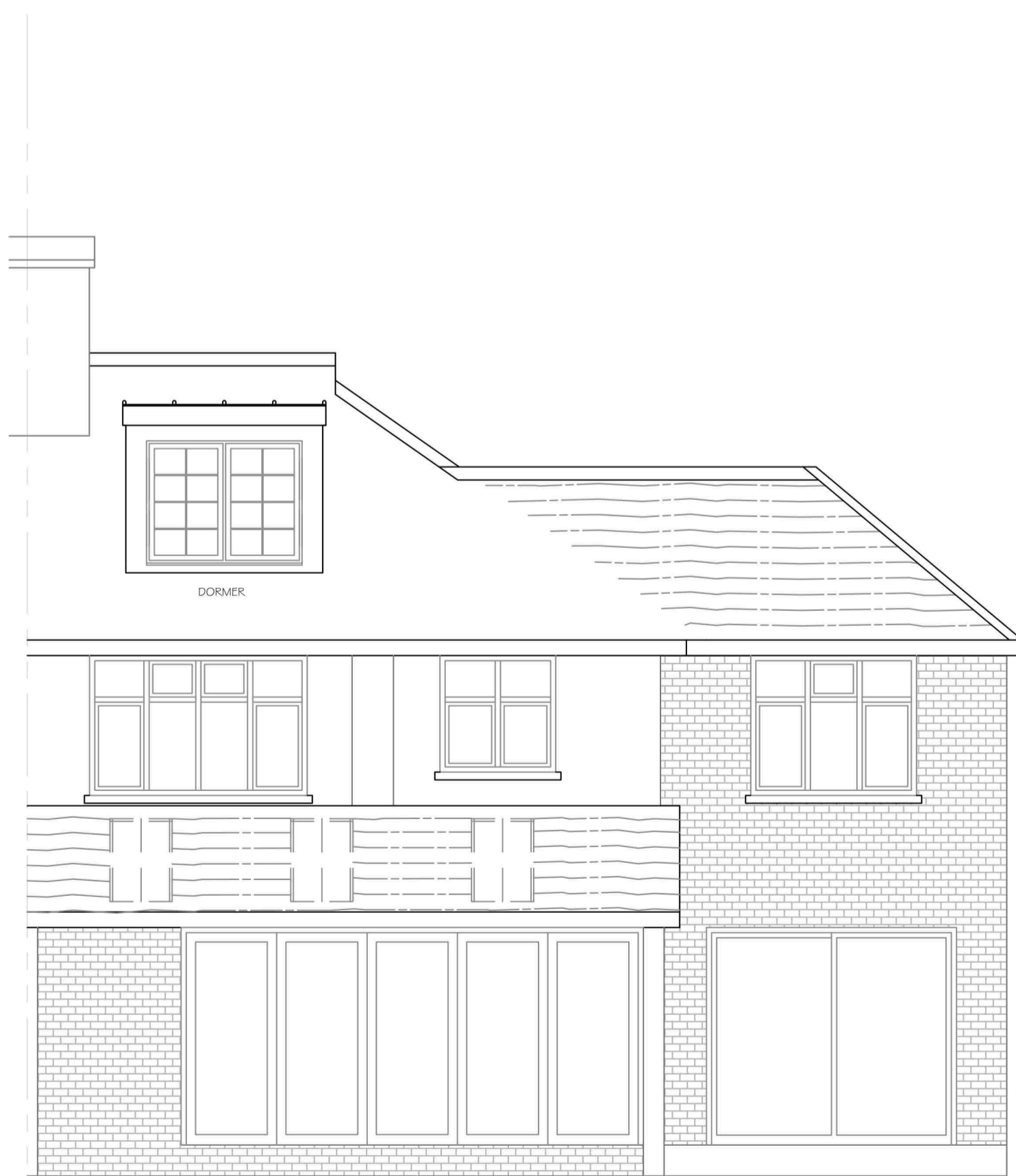
AS PROPOSED REAR ELEVATION 1:50 @ A1