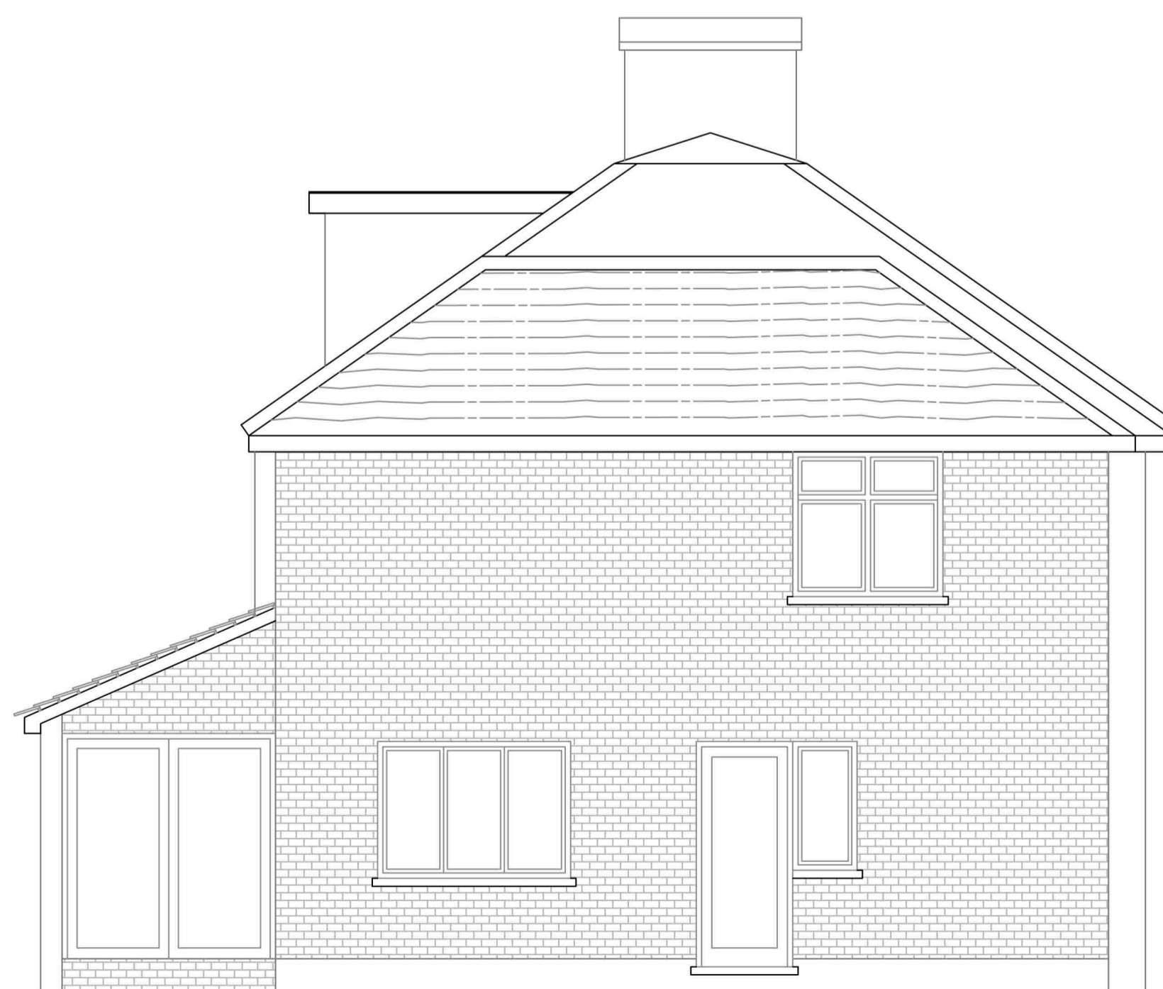
AS PROPOSED SIDE ELEVATION 1:50 @ A1