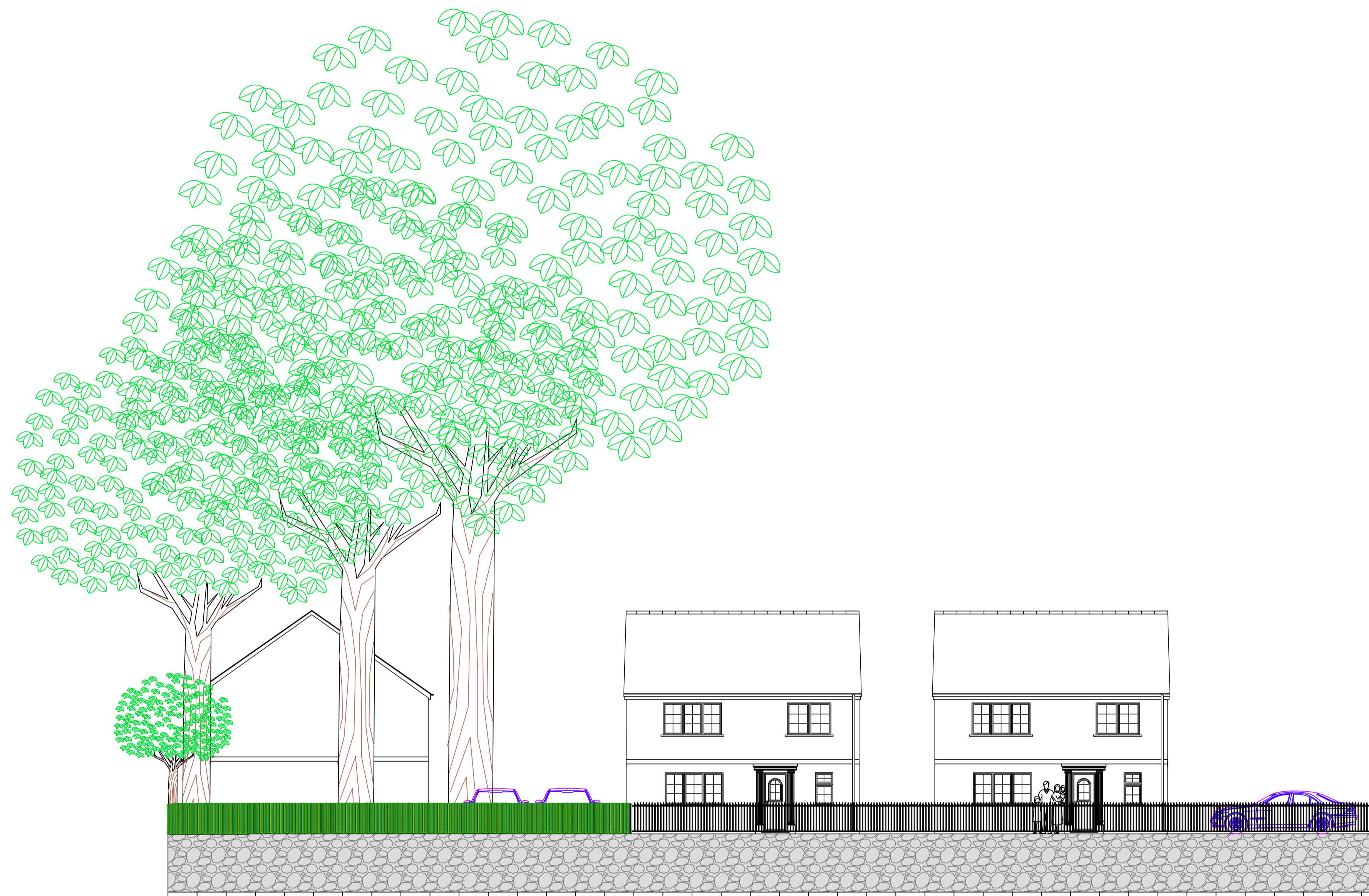
STREET SCENE FROM ROAD SIDE. SCALE @ 1:100.