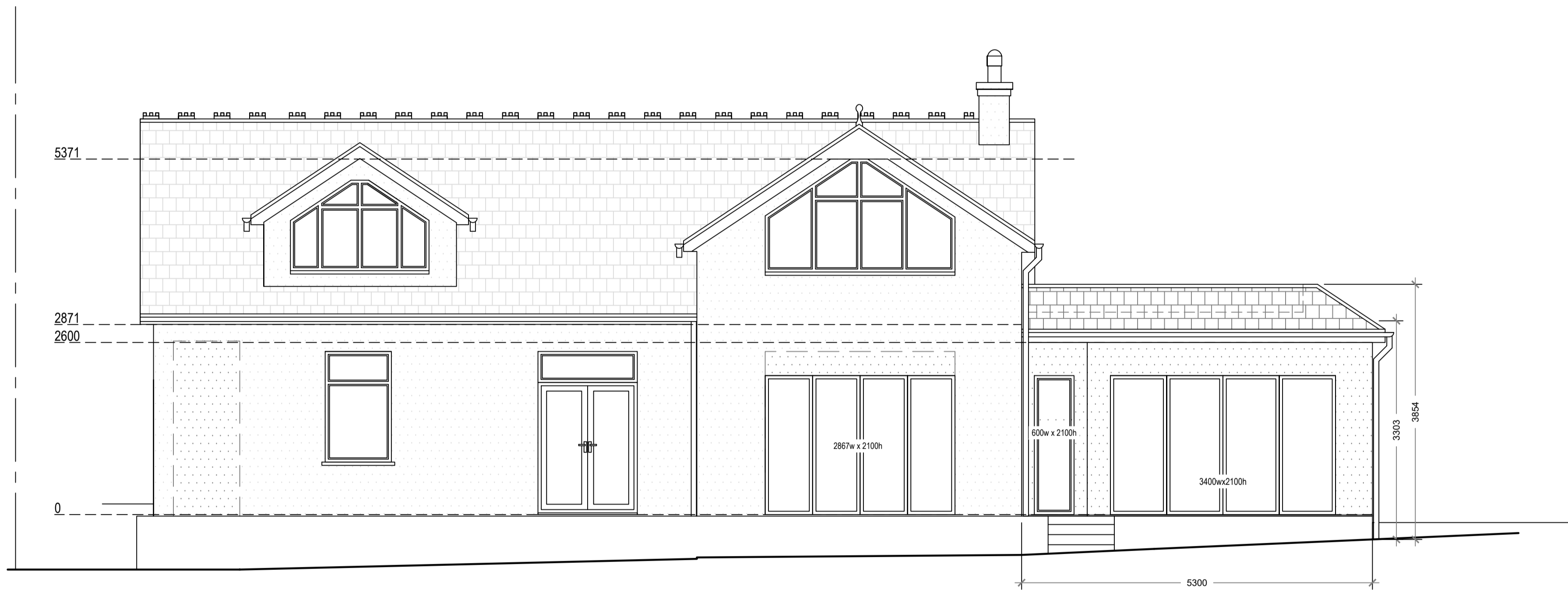
Proposed South Elevation Scale 1:50

Proposed Materials: Walls: Render (to match existing) Flat roof: Ply membrane (to match existing) Pitched roof: Tile (to match existing) Windows: Double glazed (to match existing) Skylights: Size as indicated (not protruding more than 150mm above the existing roof plane)