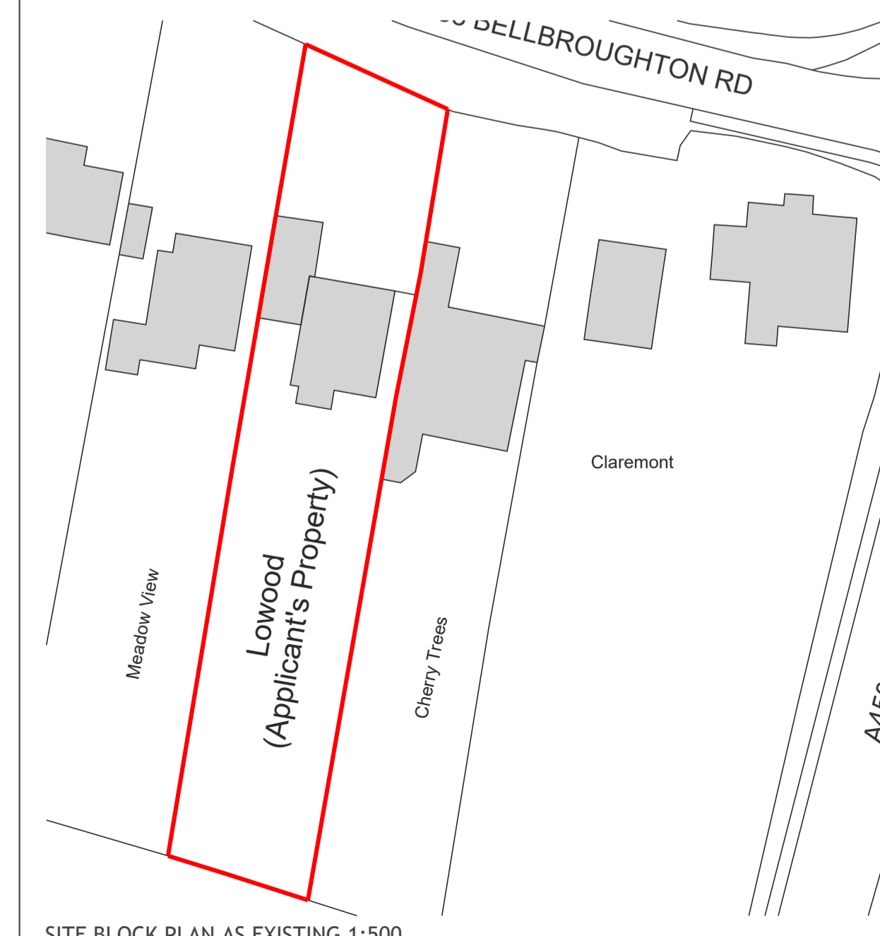
SITE BLOCK PLAN AS EXISTING 1:500