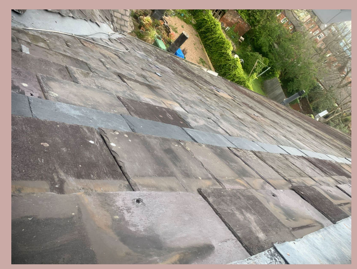
Replacement Roof Tiles Like for Like