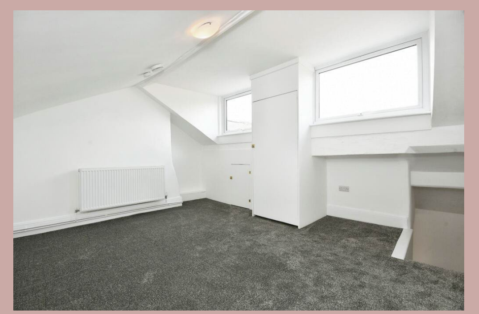
Bedroom 2 after