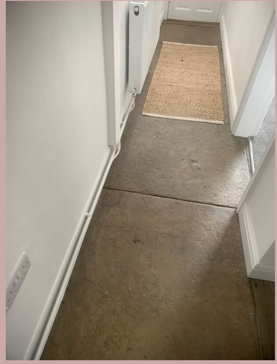
Hallway restored stone floor