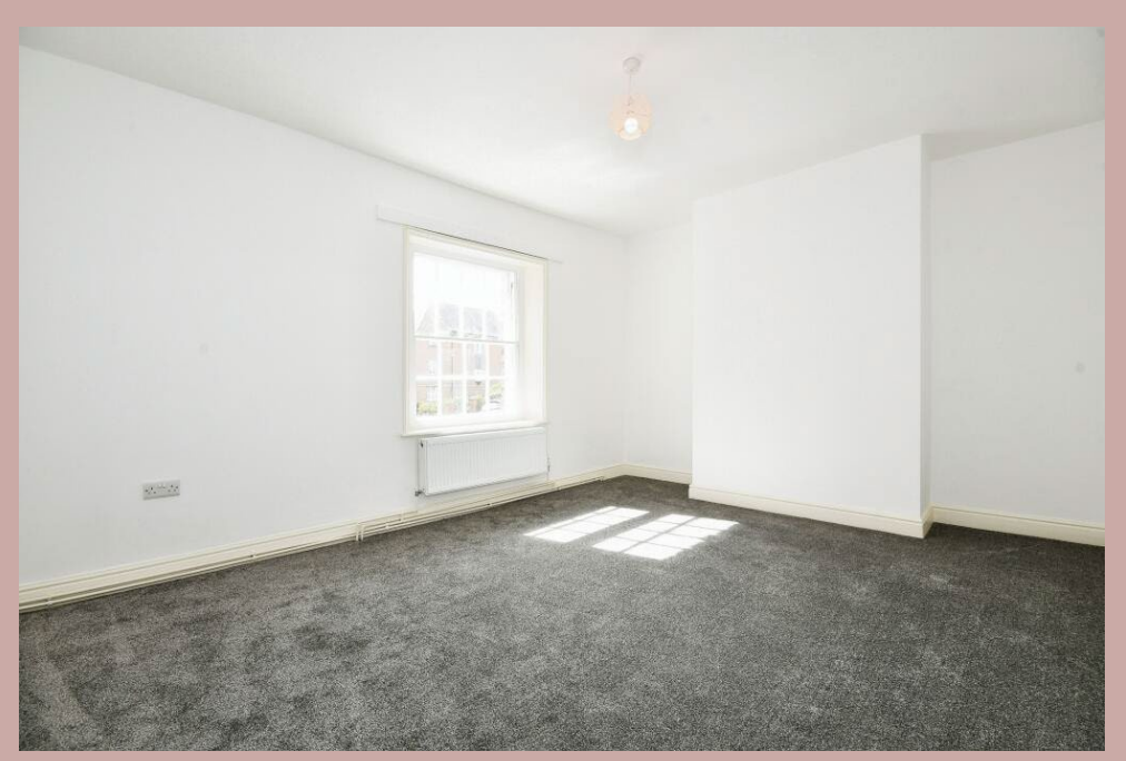
Bedroom 1 after