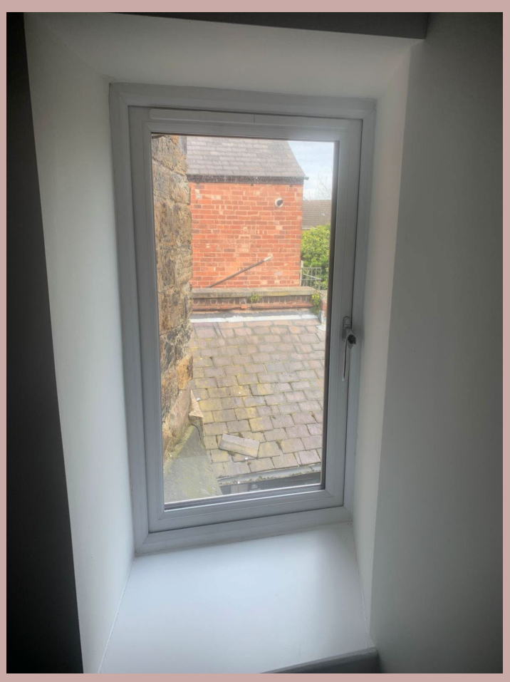
Bedroom 3 window (internal)