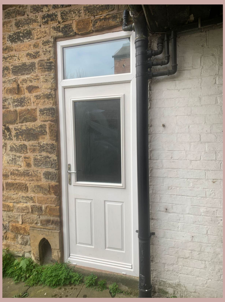
Rear door replaced with like-for-like UPVC