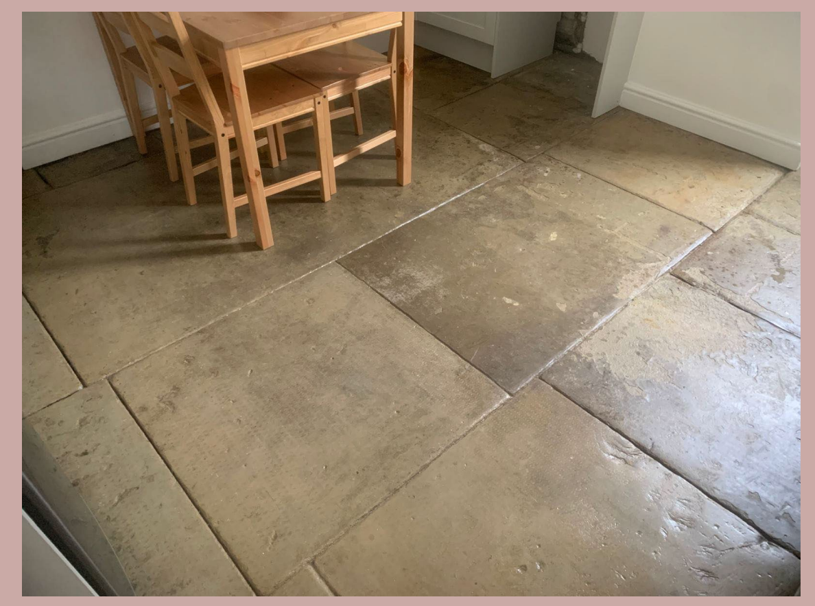
Kitchen stone floor restored