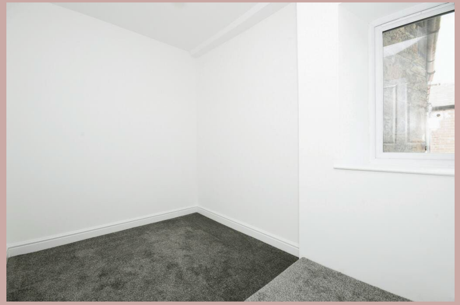
New Bedroom 3 (former section of bathroom)