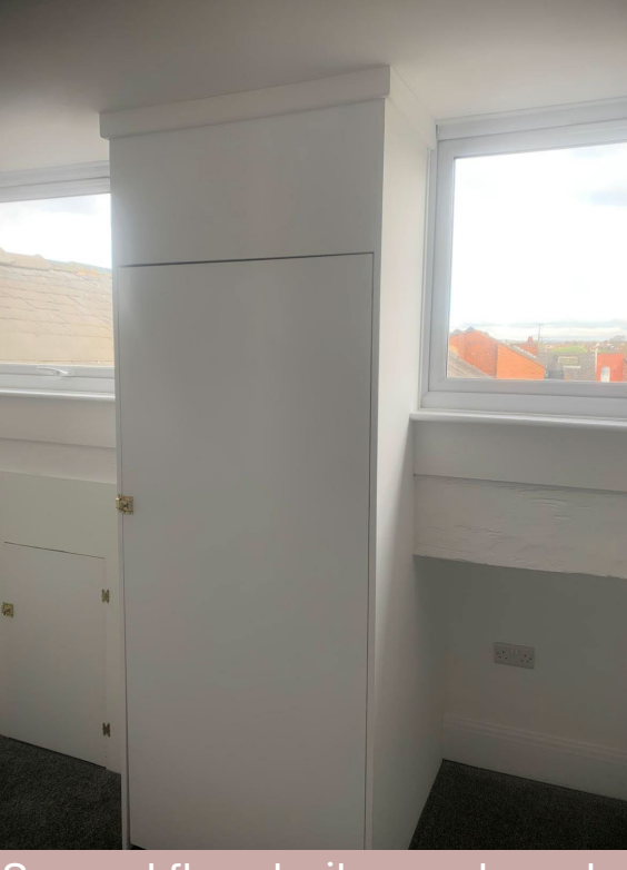
Second floor boiler cupboard