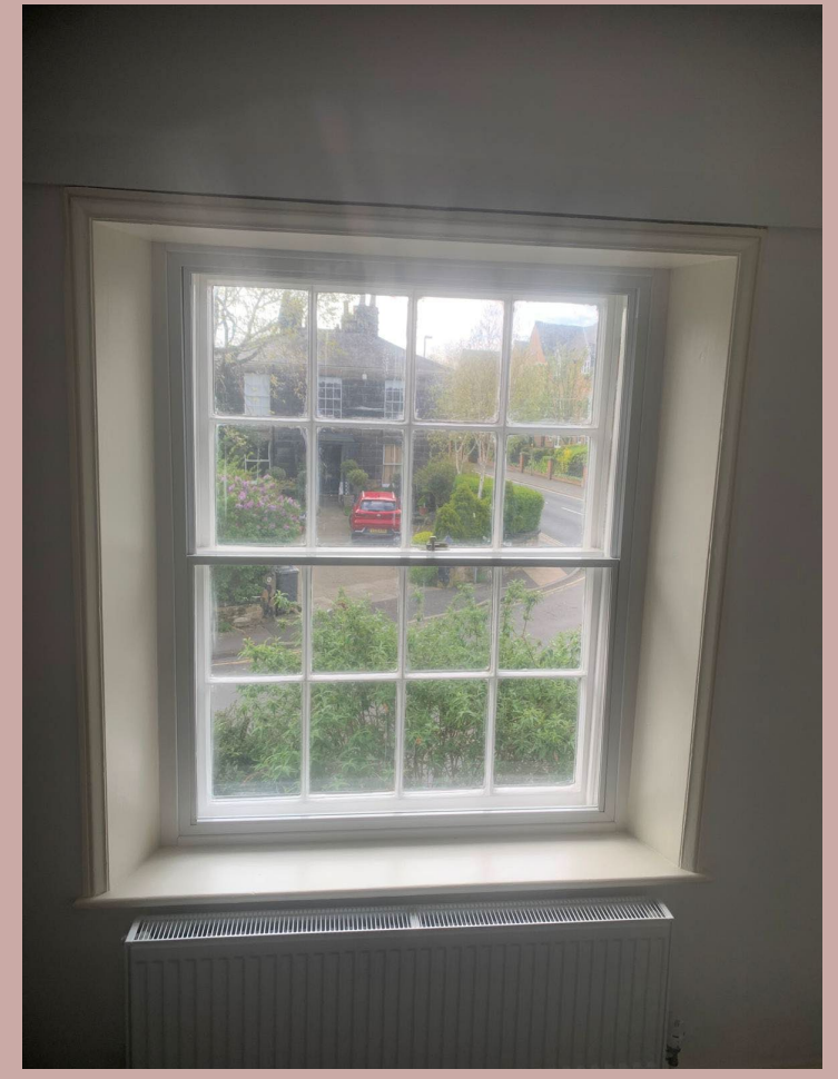
Front facing bedroom window (internal)