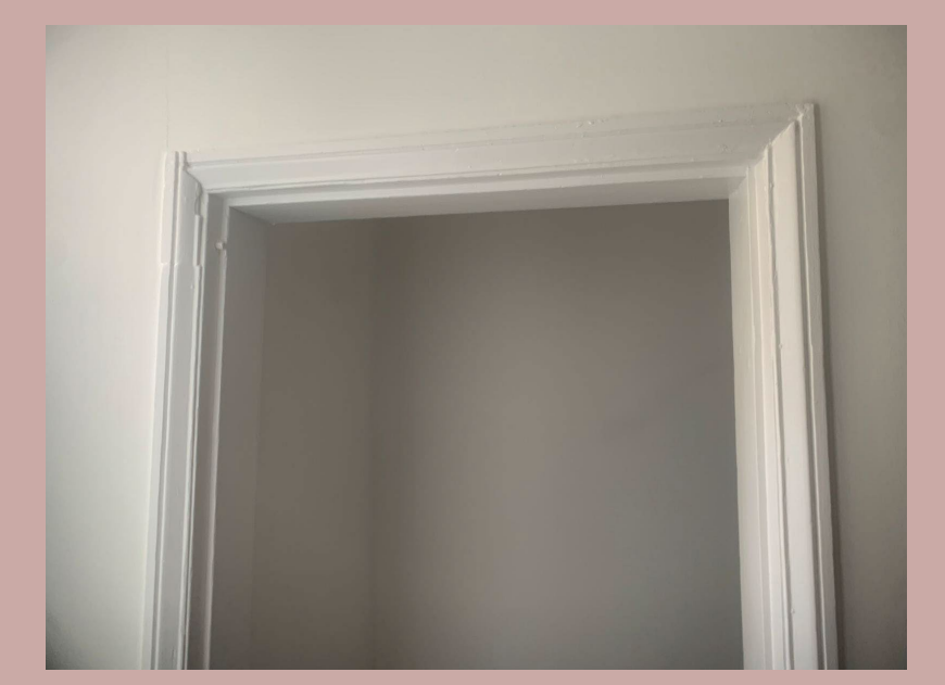
Kitchen to stairs door frame