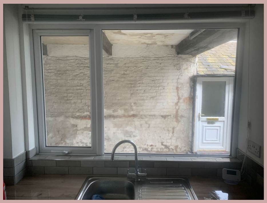
Kitchen window (internal)