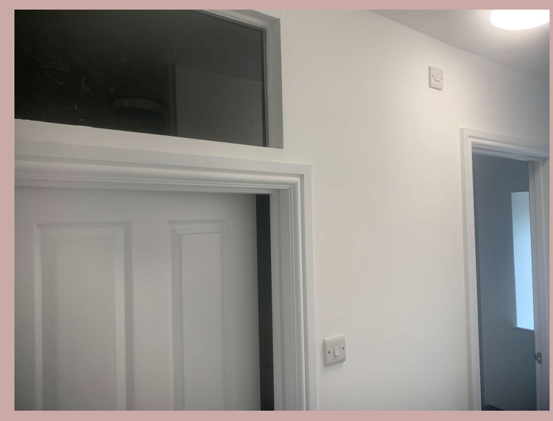
Stud wall replacing unsafe block wall