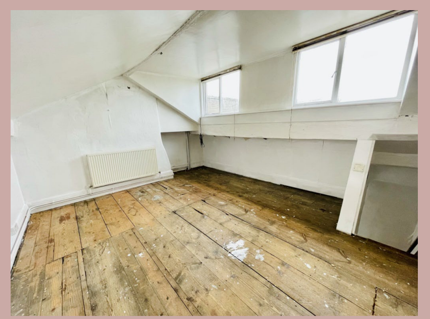
Bedroom 2 before