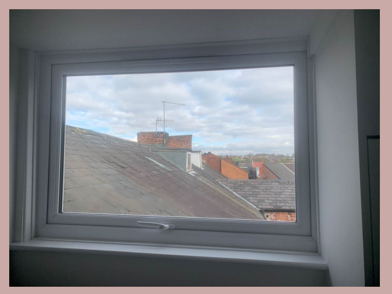
Second floor window