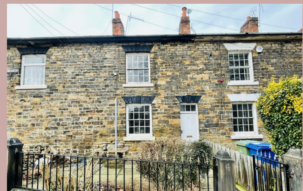
New Front Door Paint