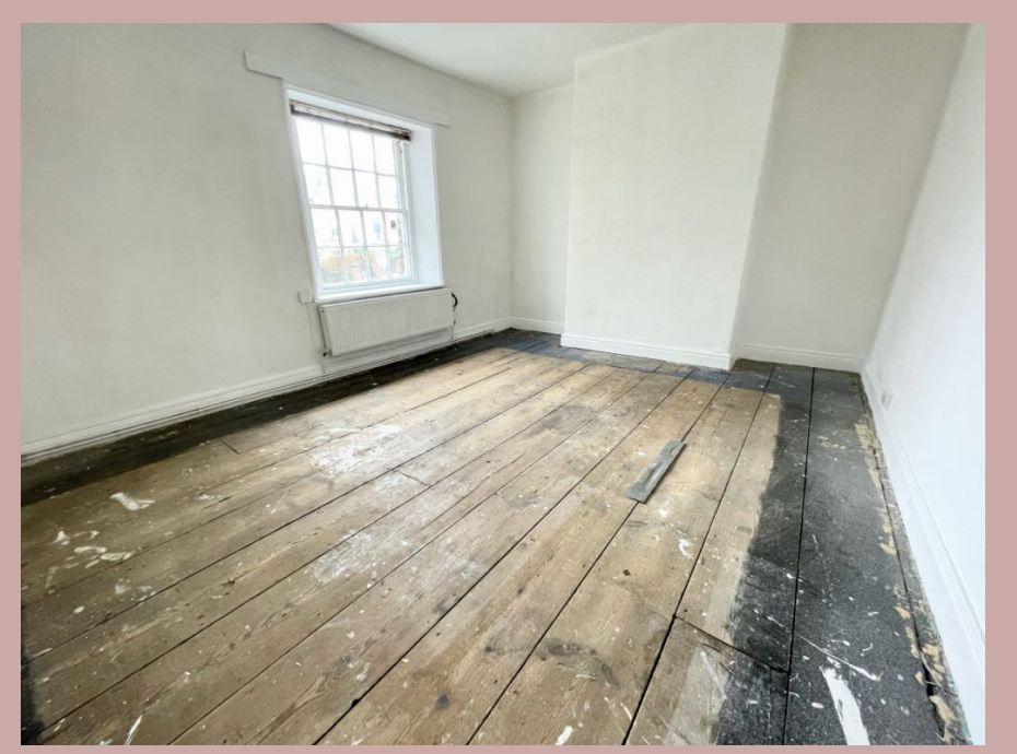
Bedroom 1 before