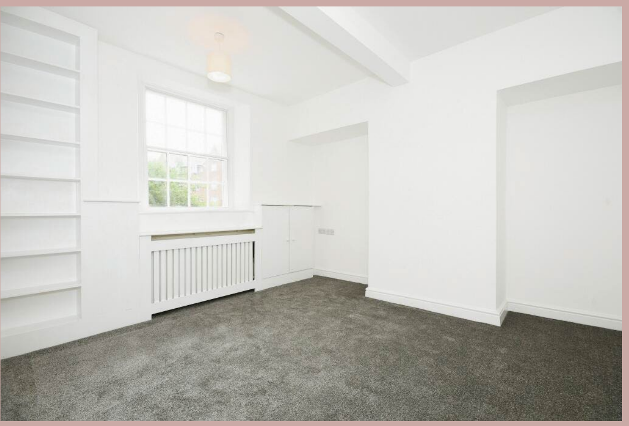
Living room afterwards (covered fireplace)