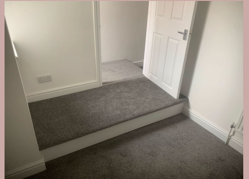
Raised floor for soil pipe