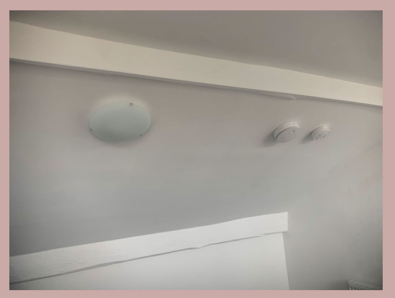
Second floor beams