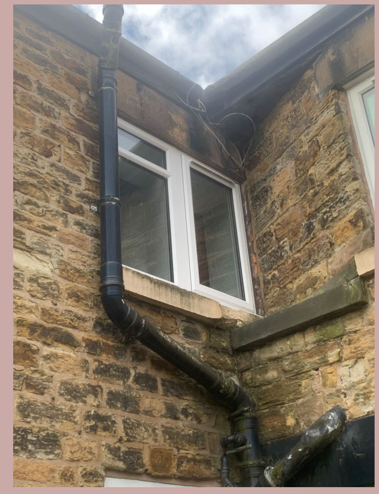
Rear first-floor window replaced with like-for-like UPVC