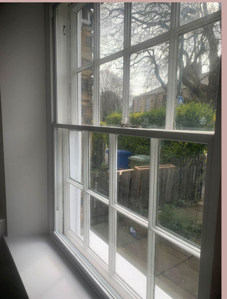
Secondary Glazing in Ground Floor Sash Window