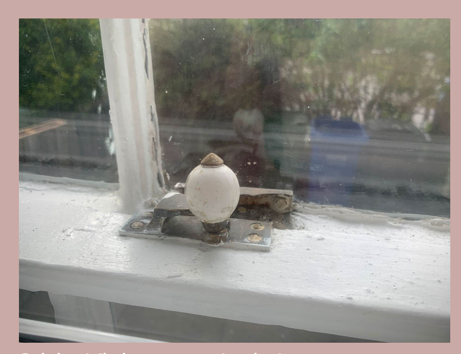
Original fittings to sash windows retained