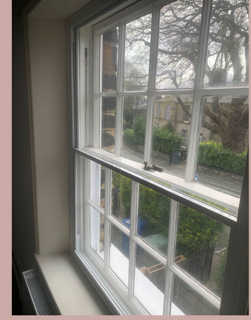
Secondary Glazing in First Floor Sash Window