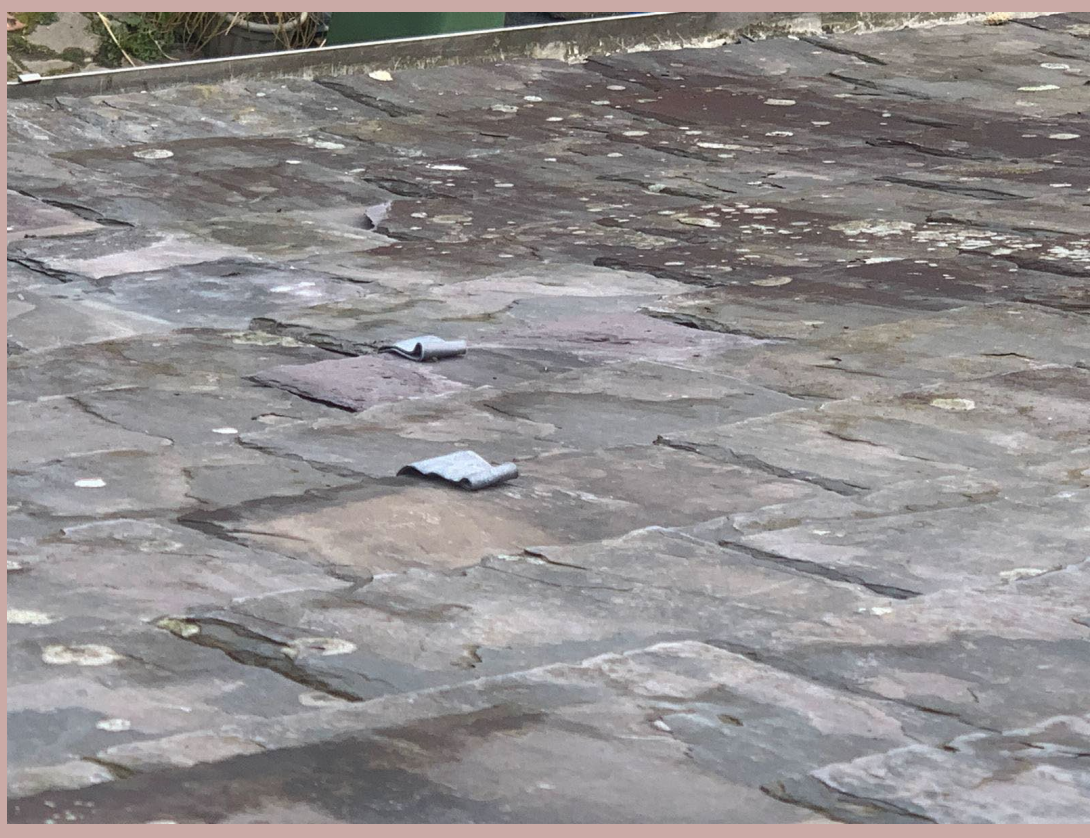
Roof tile clips