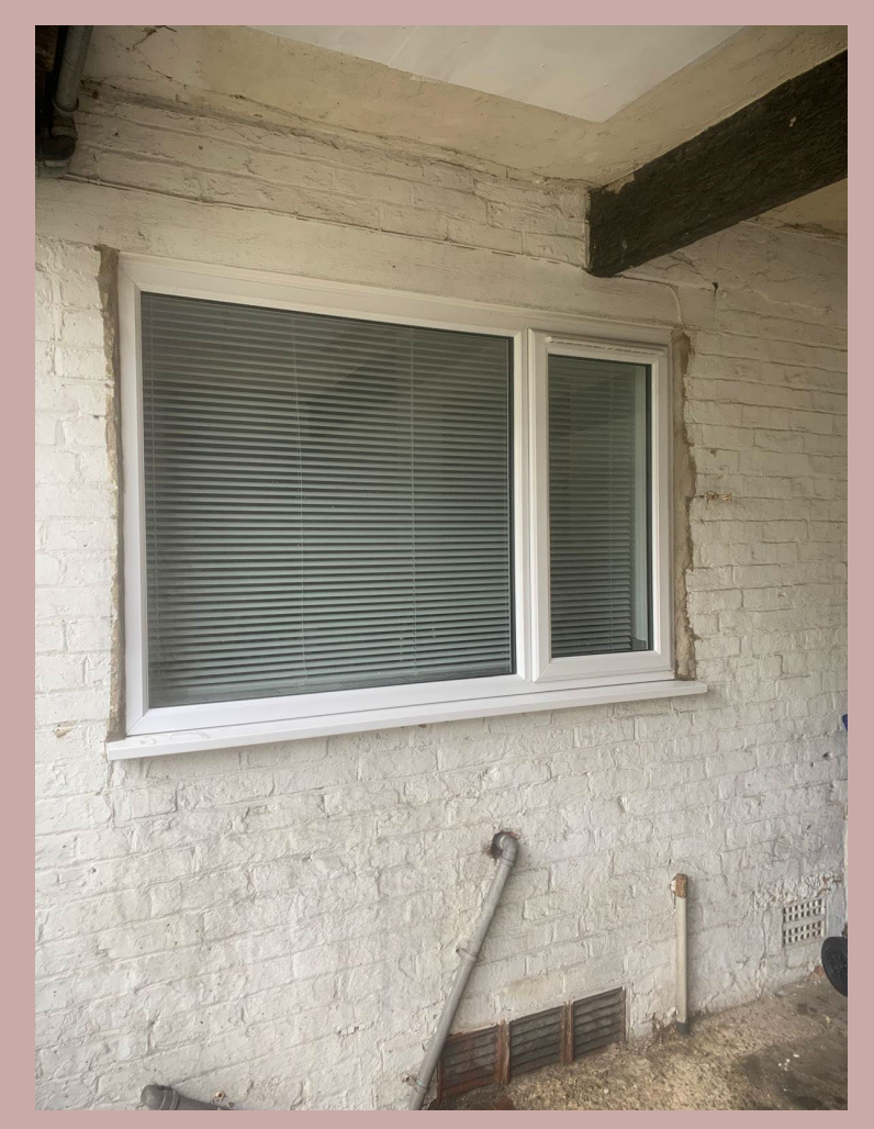
Rear ground floor window replaced with like-for-like UPVC