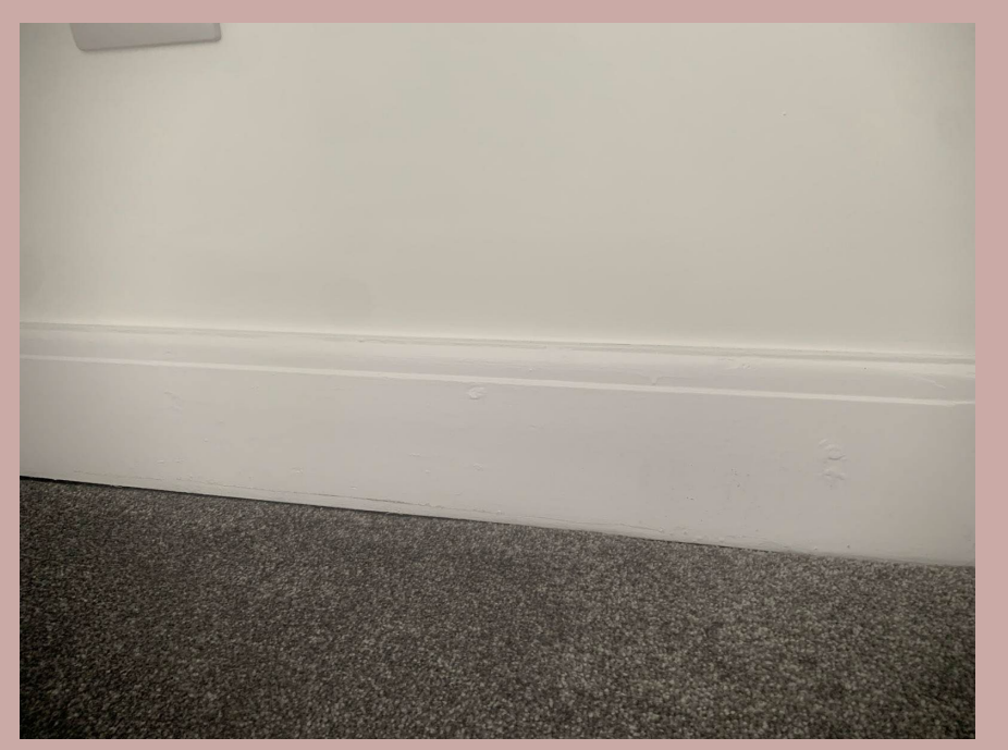
Second floor skirting