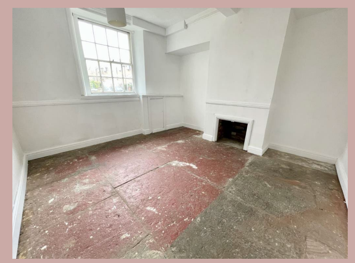
Living room before