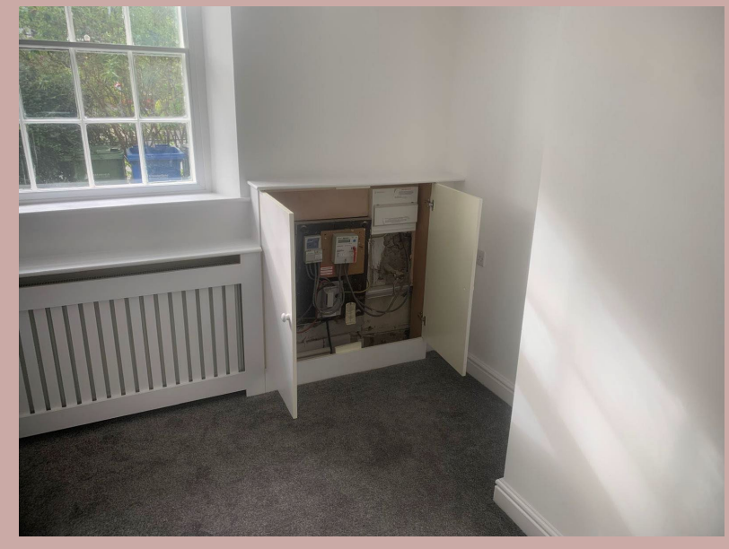
Living room fuse housing