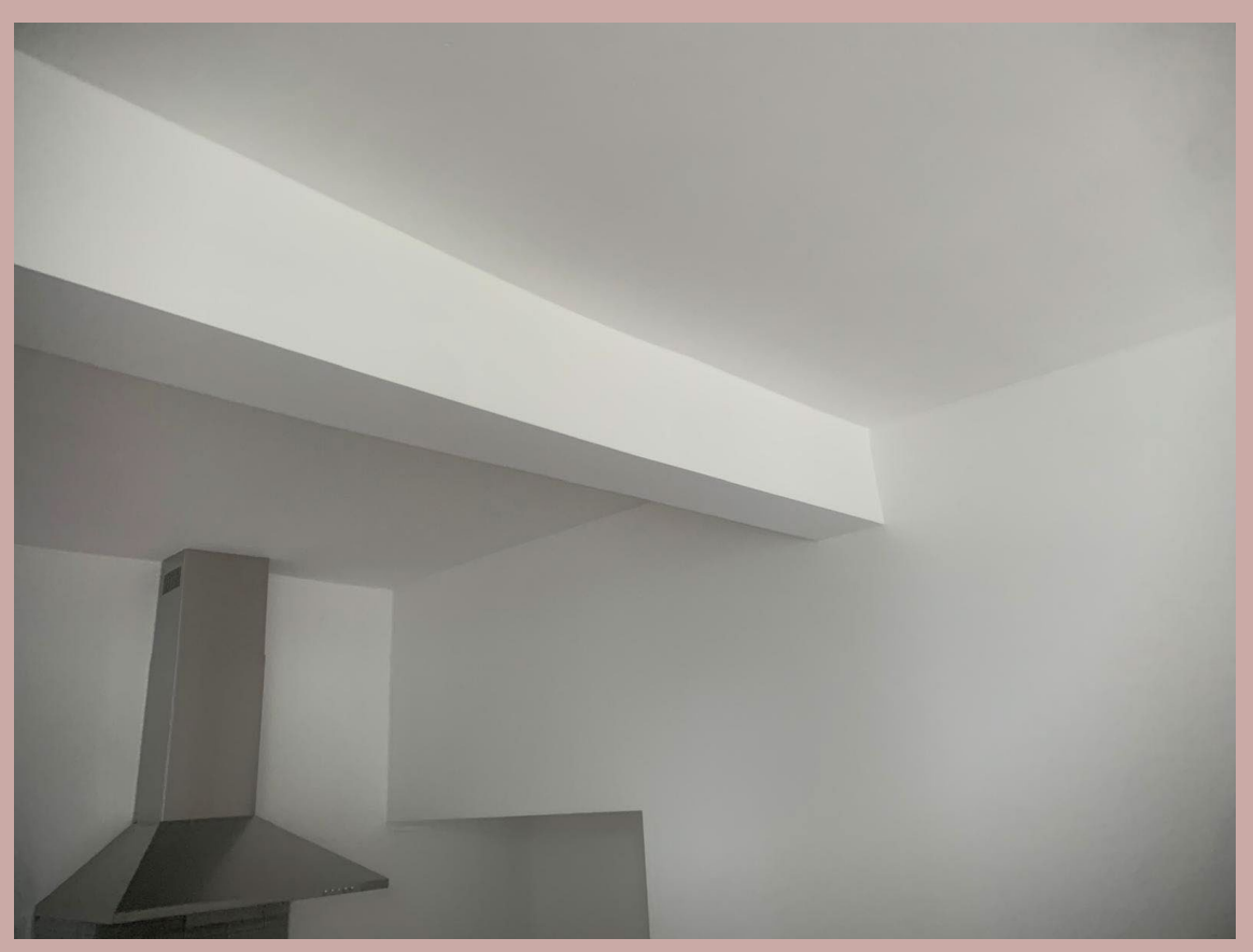
Kitchen beam covered