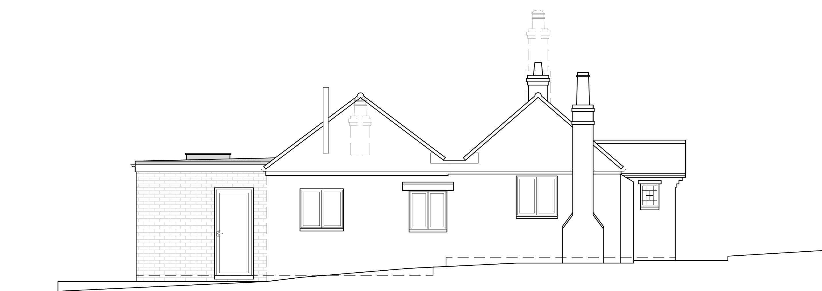
Internal and external levels 1:50