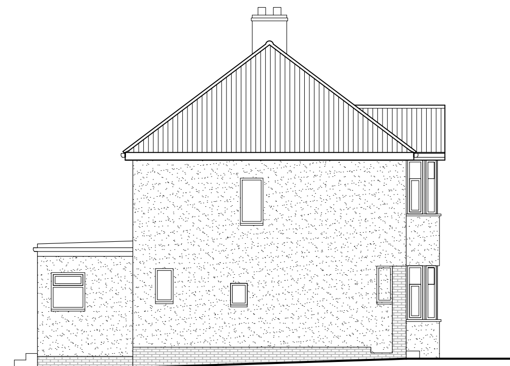
EXISTING SIDE (NORTH) ELEVATION