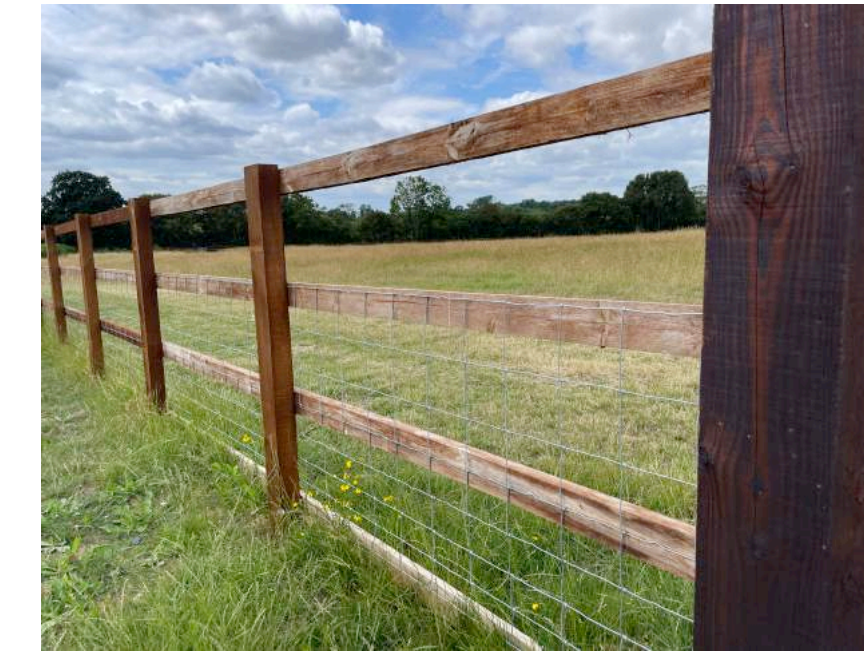
Proposed post & rail fence to match existing