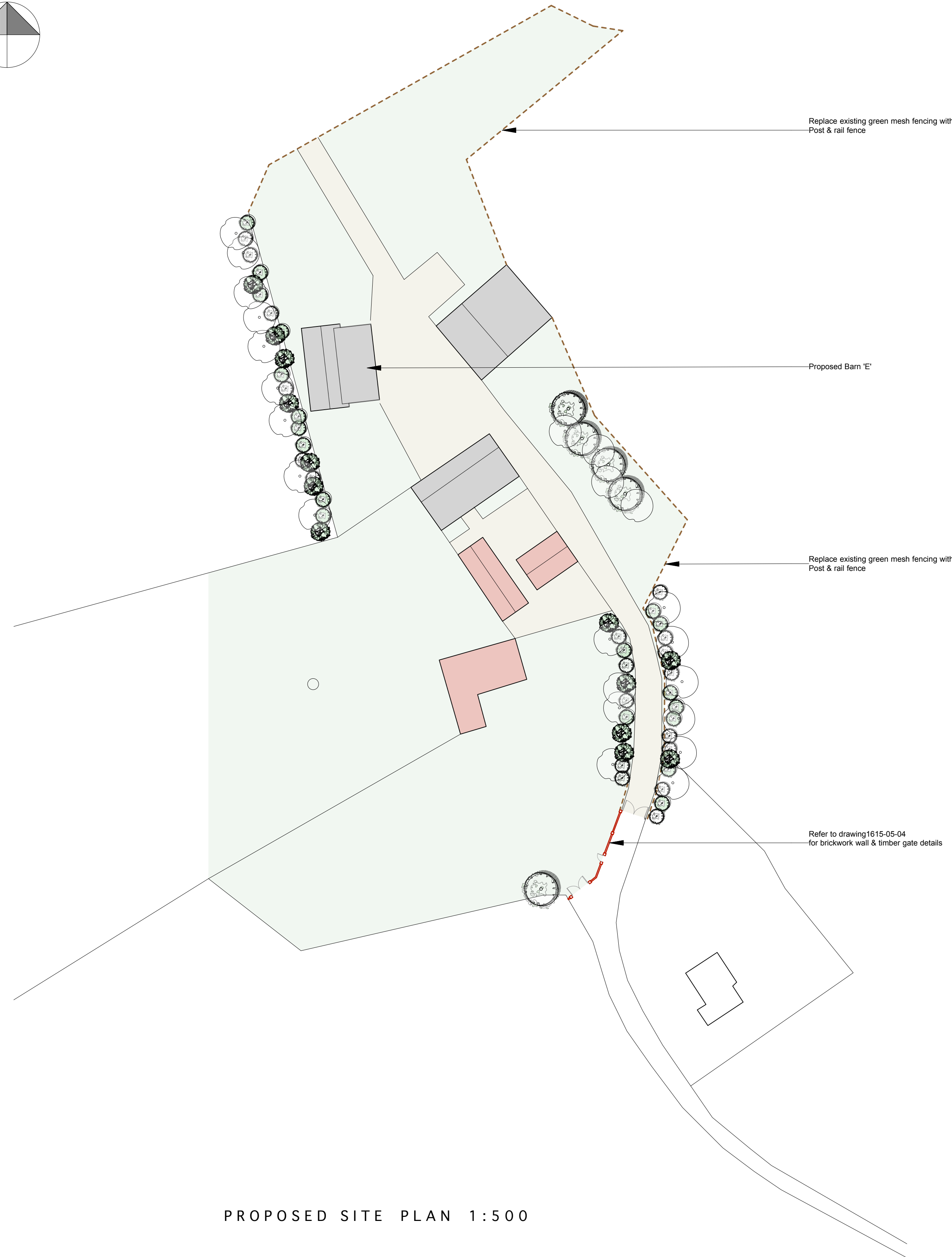
PROPOSED SITE PLAN 1:500