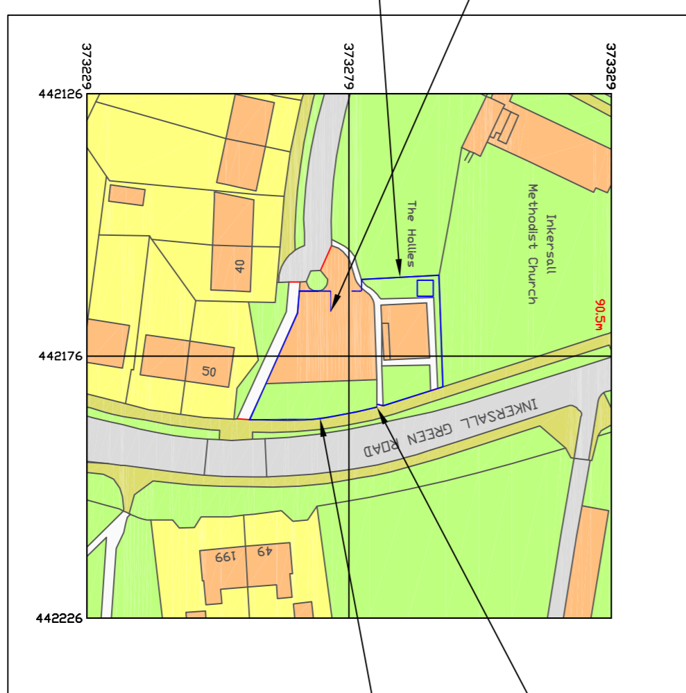
SITE PLAN 1:1000 BLUE LINE DEPICTS NEW FENCE AND ACCESS GATES

Produced on 05 December 2023 from the Ordnance Survey National Geographic Database and incorporating surveyed revision available at the date. The map shows the area bounded by 44216, 372879, 44226, 372879, 442176, 372879, 44226, 372879, 442176, 372879. Ordnance Survey copyright and database rights 2023 OS 100041326. Supplied by data for viewing as UrbanPlanning.com a licensed Ordnance Survey partner. OS 100041326. Data licence expires 05 December 2024. Unique plan reference: UK/100041326/19/44216