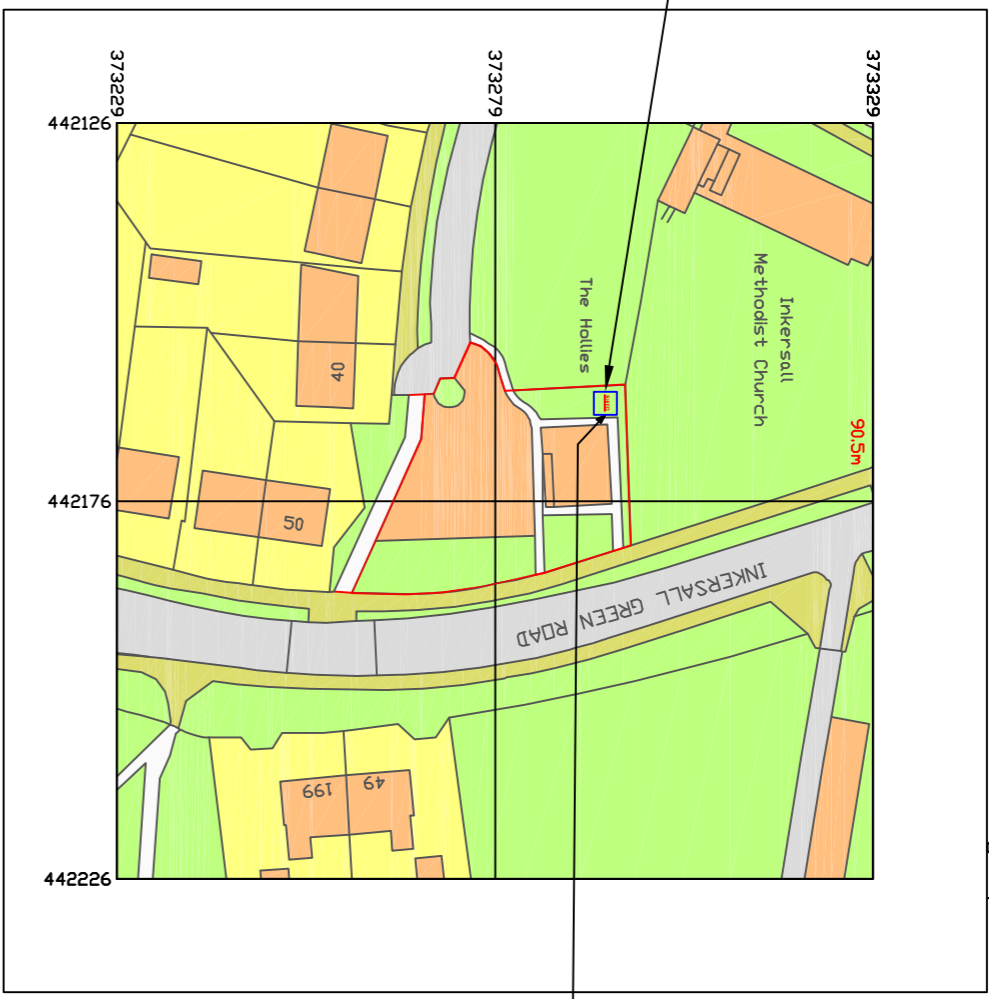
SITE PLAN 1:1000 RED LINE DEPICTS BOUNDARY

Produced on 05 December 2023 from the Ordnance Survey National Geographic Database and incorporating surveyed revision available at the date. The map shows the area bounded by 44216, 372879, 44226, 372879, 442176, 372879, 44226, 372879, 442176, 372879. Ordnance Survey copyright and database rights 2023 OS 100041326. Supplied by data for viewing as UrbanPlanning.com a licensed Ordnance Survey partner. OS 100041326. Data licence expires 05 December 2024. Unique plan reference: UK/100041326/19/44216